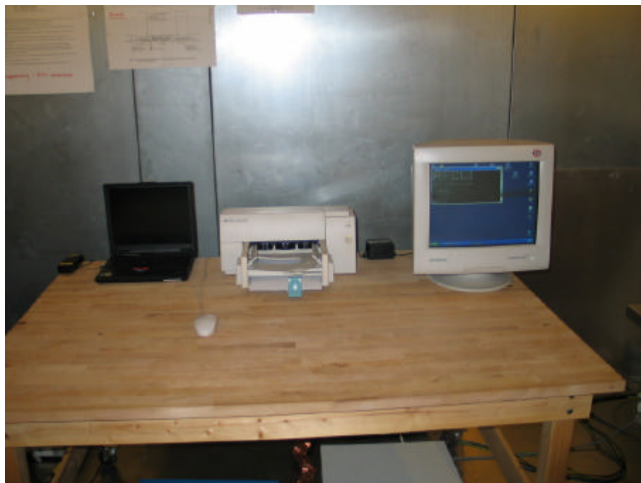
Picture 4 : Setup for conducted emission measurement on the AC mains