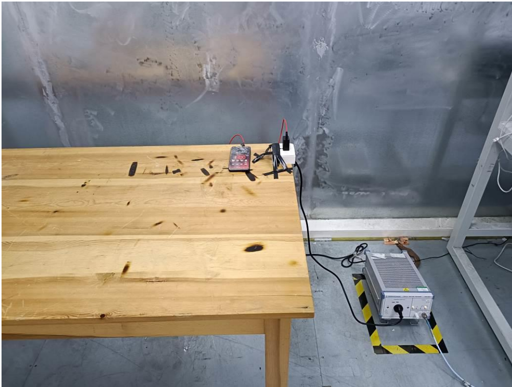
AC Conducted Emission of charge from power adapter mode