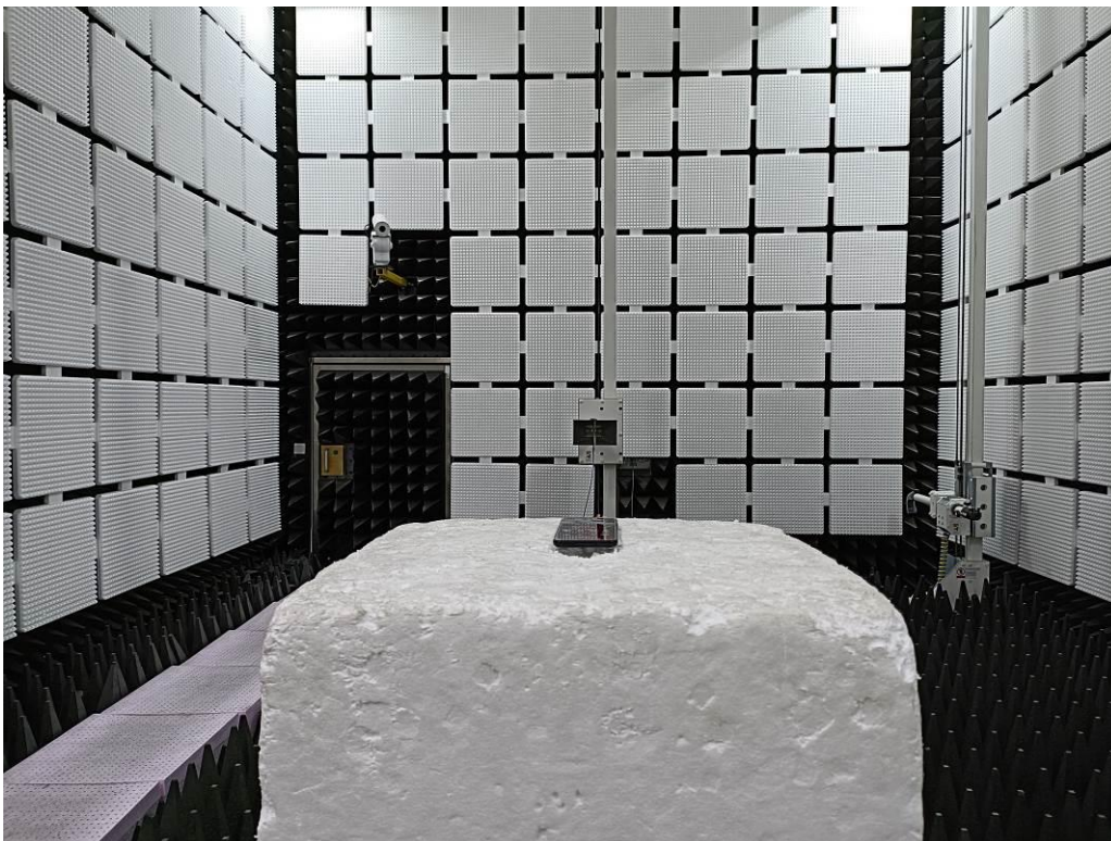
Fig. 2 (Above 1GHz)