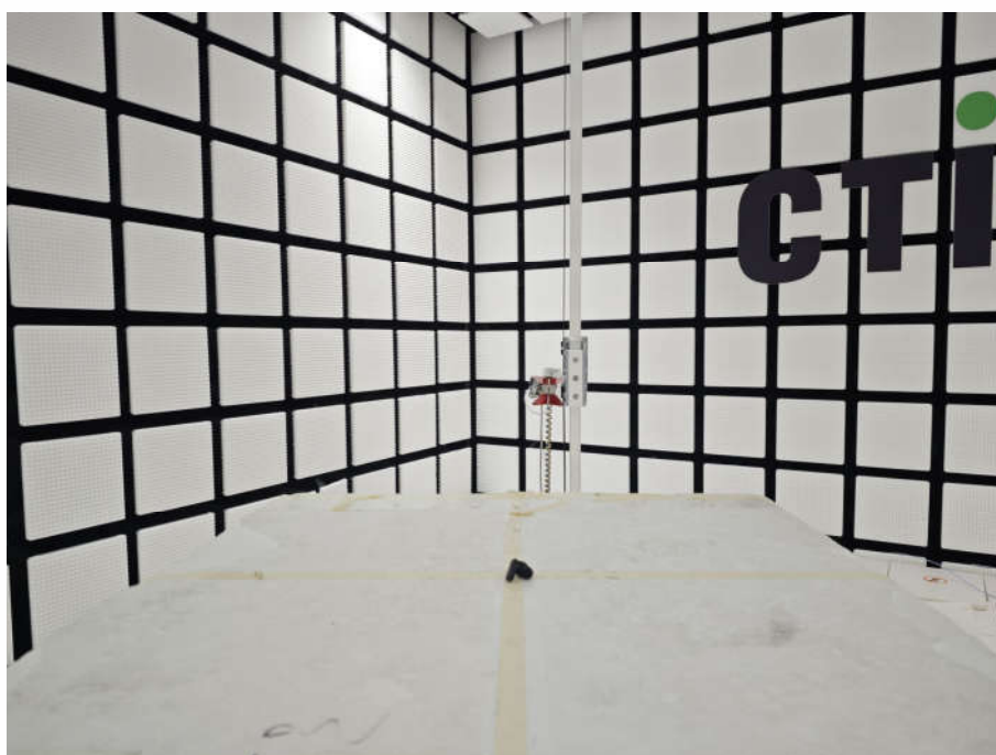
Radiated spurious emission Test Setup-2(Above 1GHz)(Ear R)