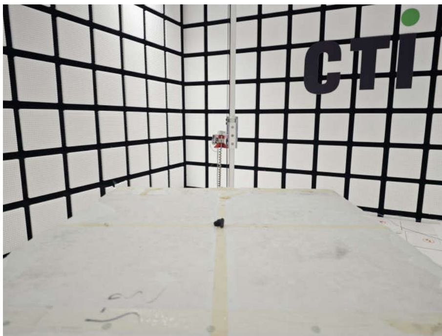
Radiated spurious emission Test Setup-2(Above 1GHz)(Ear L)