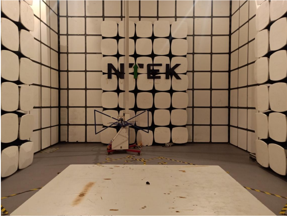
Radiated Measurement Photos (Left)