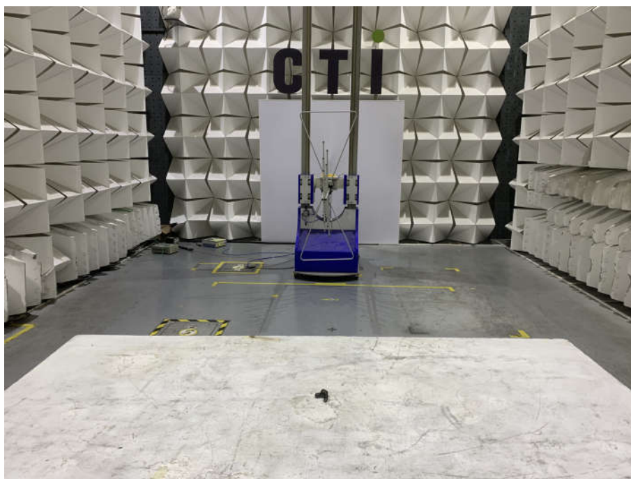
Radiated spurious emission Test Setup-1 right ear(Below 1GHz)