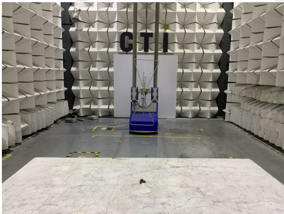
Radiated spurious emission Test Setup-1 left ear(Below 1GHz)