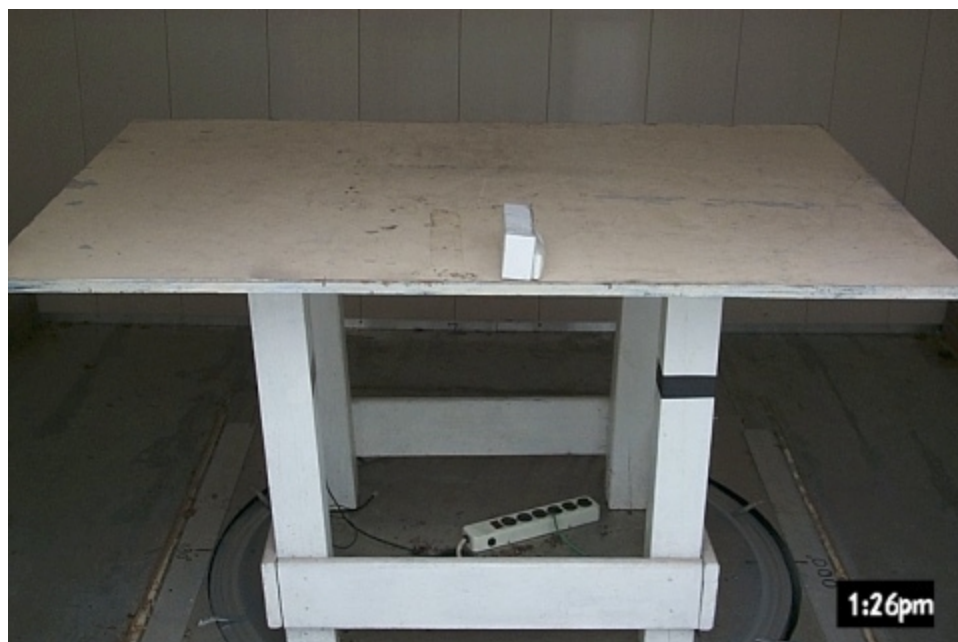
Figure 3.2 Radiated Test Setup, Position 2