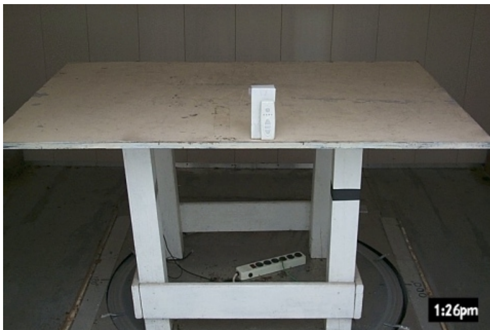
Figure 3.3 Radiated Test Setup, Position 3