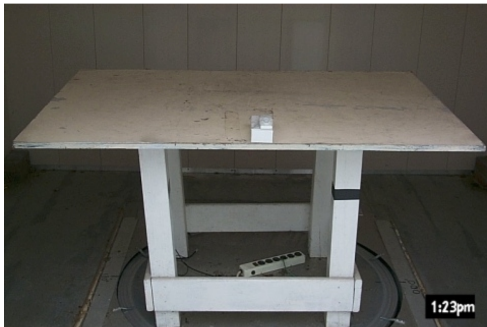
Figure 3.1 Radiated Test Setup, Position 1