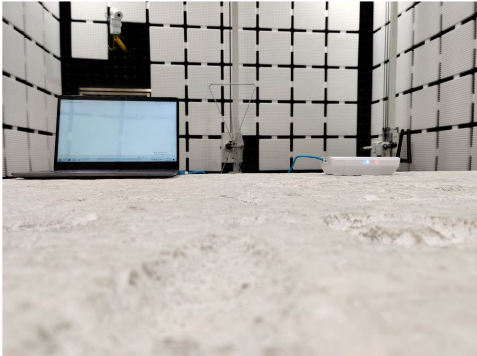
Fig. 1 (Below 1GHz)