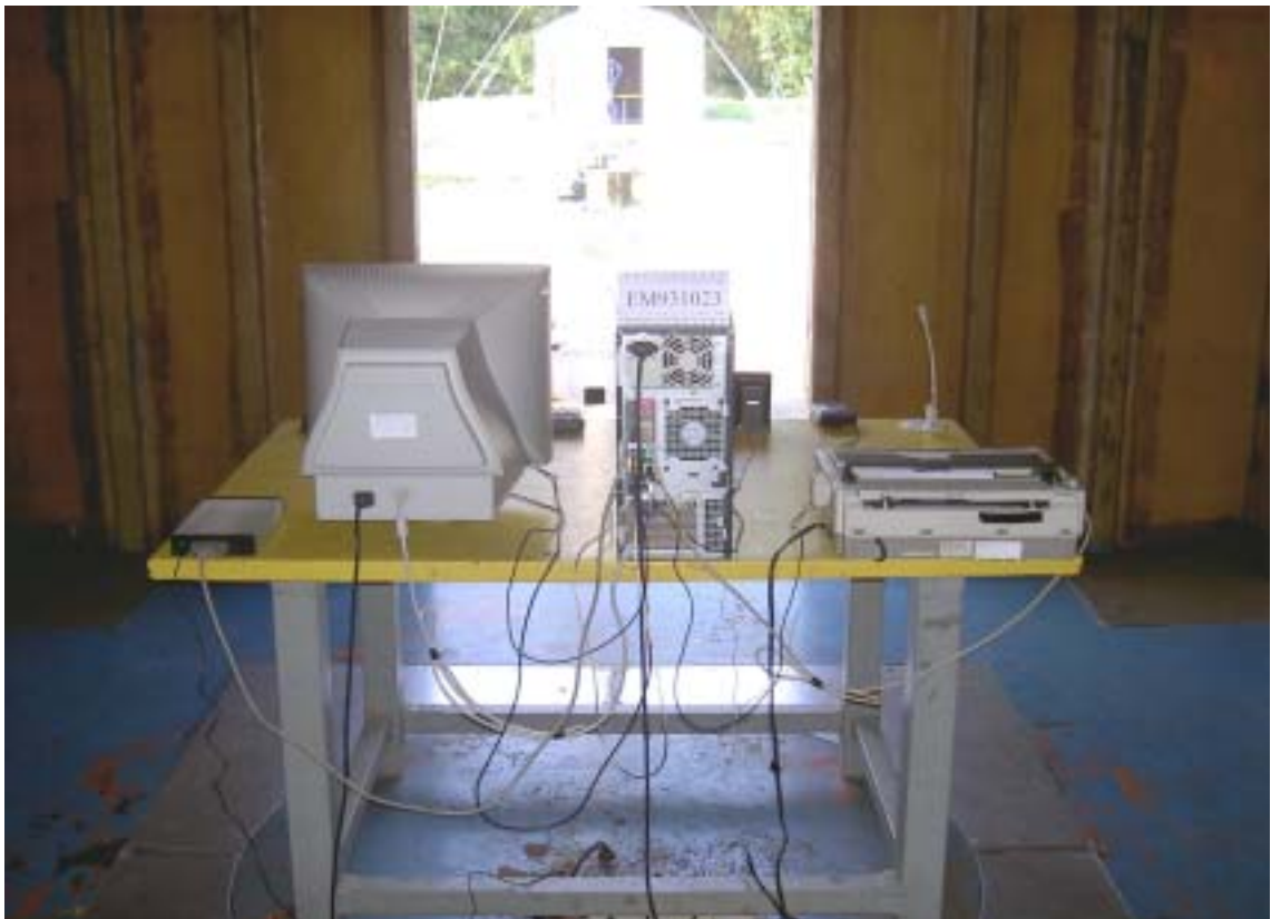
BACK VIEW OF RADIATED MEASUREMENT