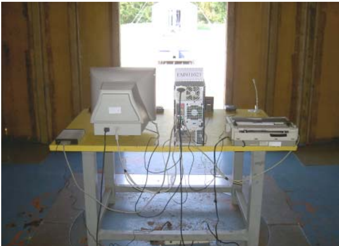
BACK VIEW OF RADIATED MEASUREMENT