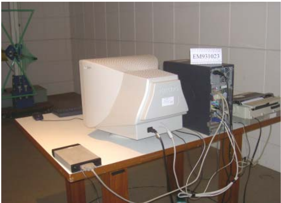
BACK VIEW OF RADIATED MEASUREMENT