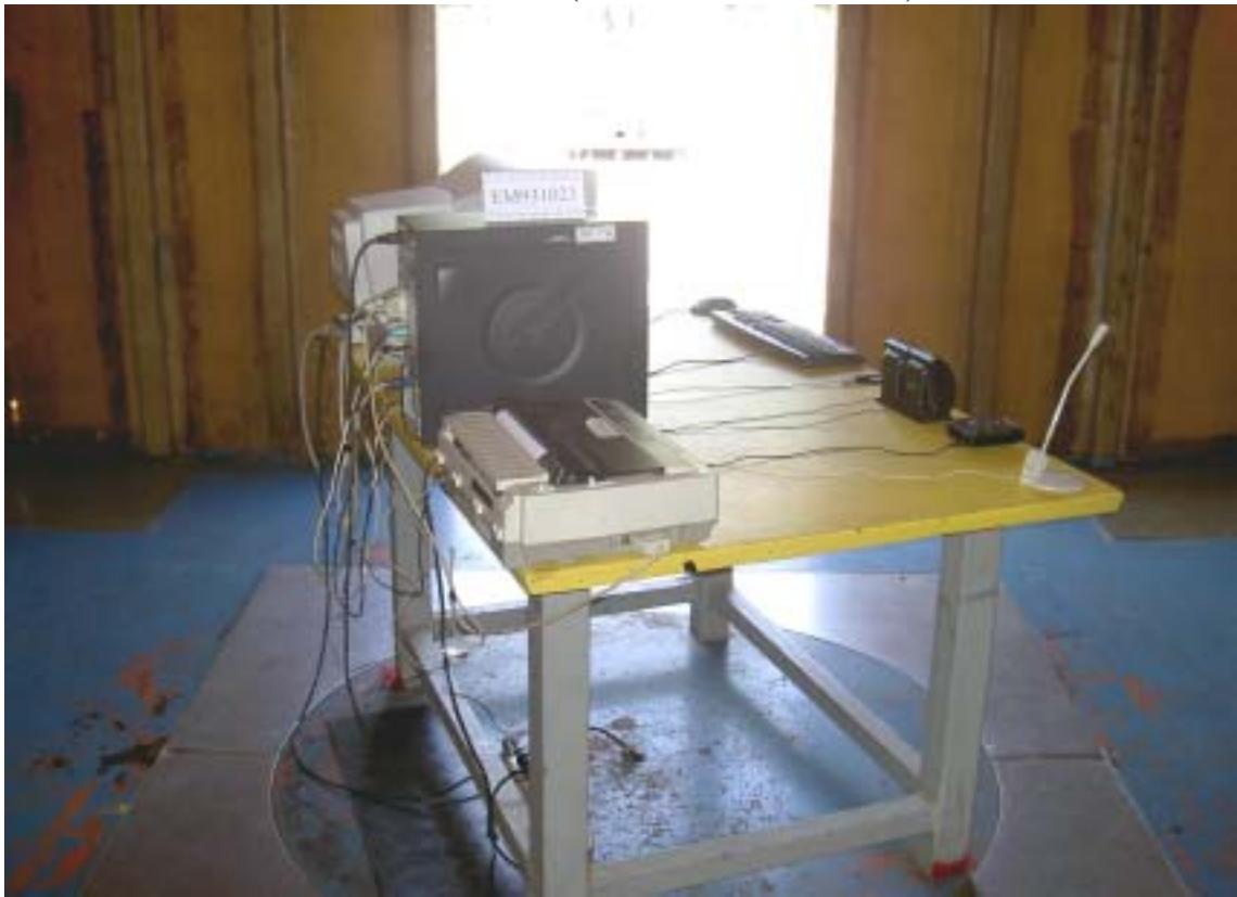
SETUP WITH MAXIMUM DETECTED EMISSION AT HORIZONTAL POLARIZATION

Test Mode: 1600*1200/75Hz (Serial No.: TY0404432)