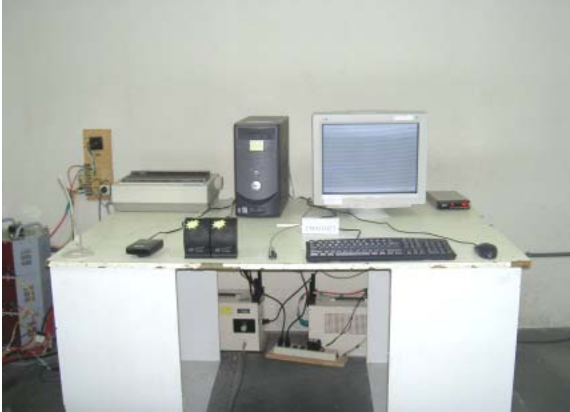
FRONT VIEW OF CONDUCTED MEASUREMENT