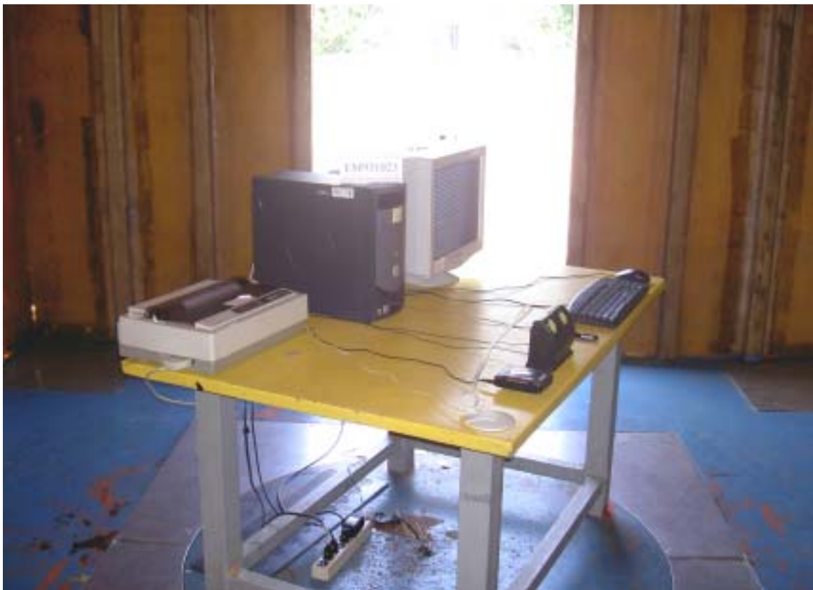
SETUP WITH MAXIMUM DETECTED EMISSION AT VERTICAL POLARIZATION