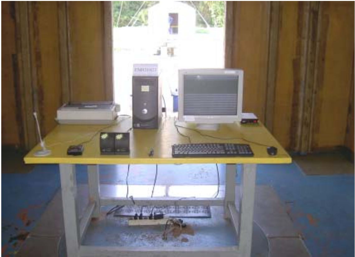
FRONT VIEW OF RADIATED MEASUREMENT