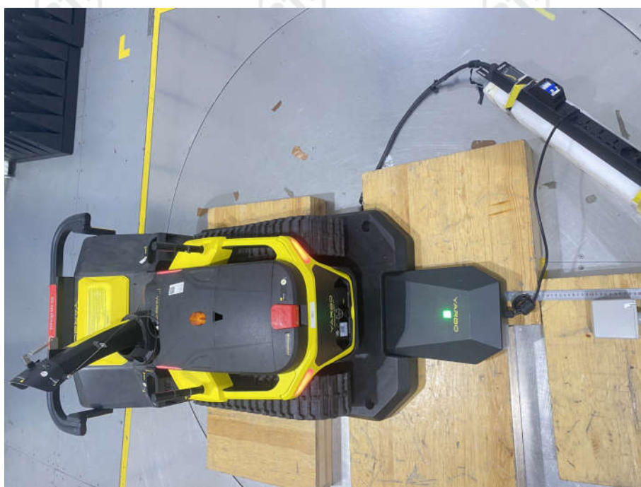
Test Setup of Front