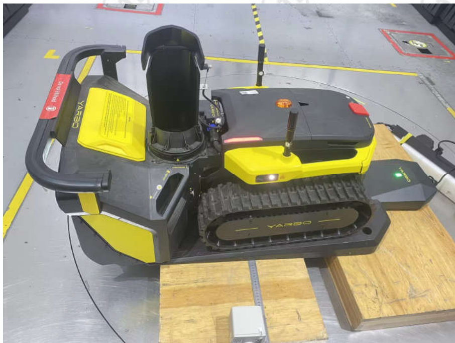
Test Setup of Right