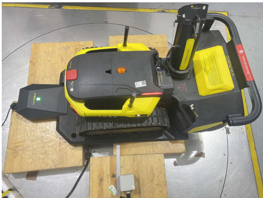
Test Setup of Left