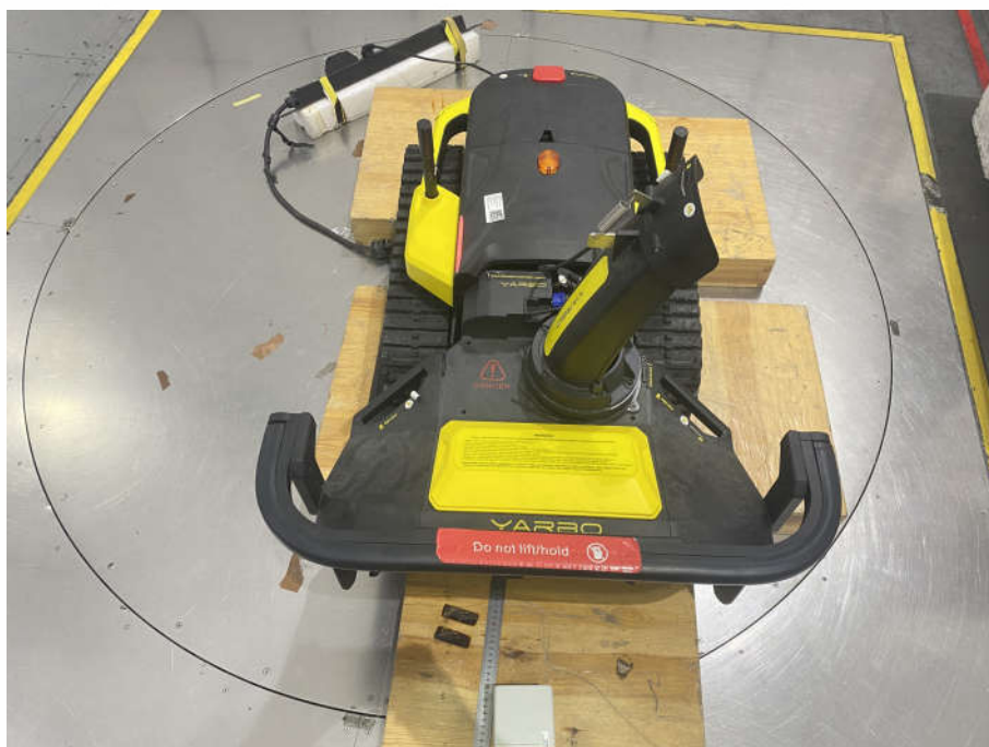
Test Setup of Rear