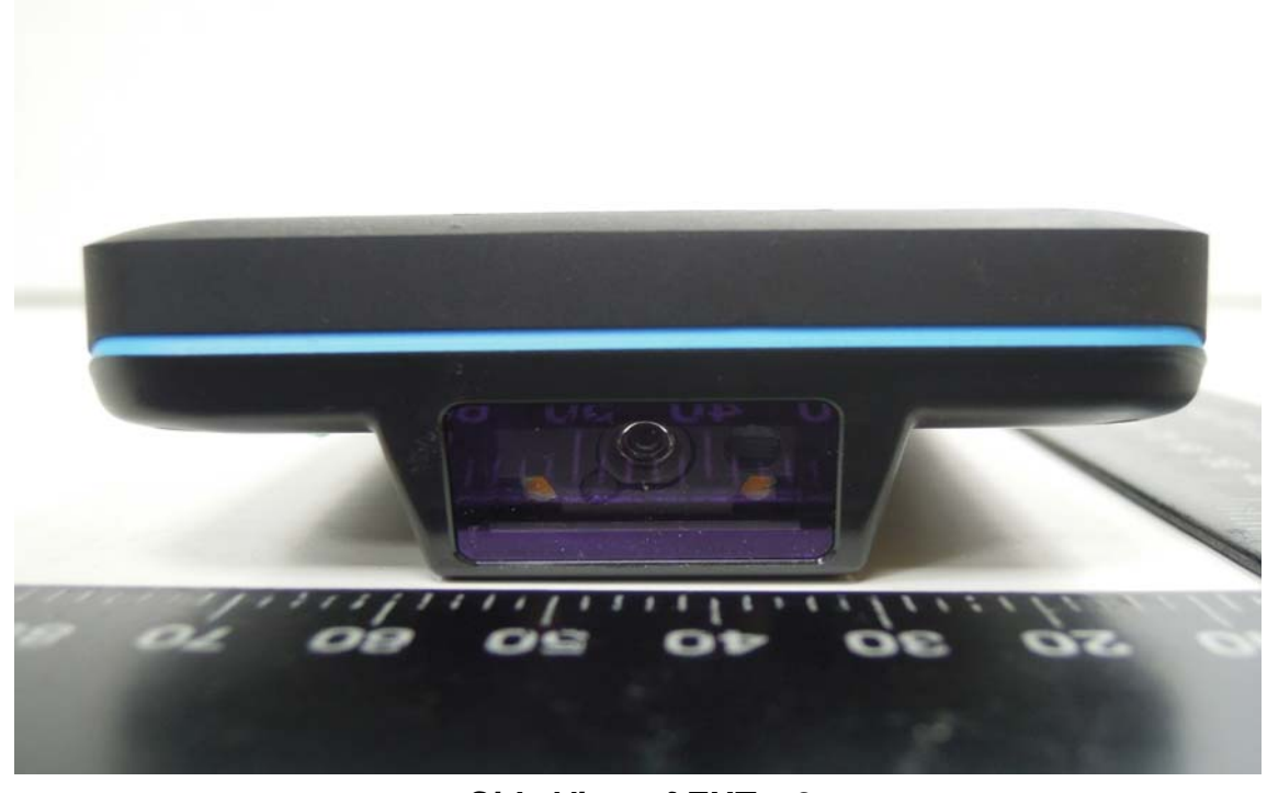
Side View of EUT - 3