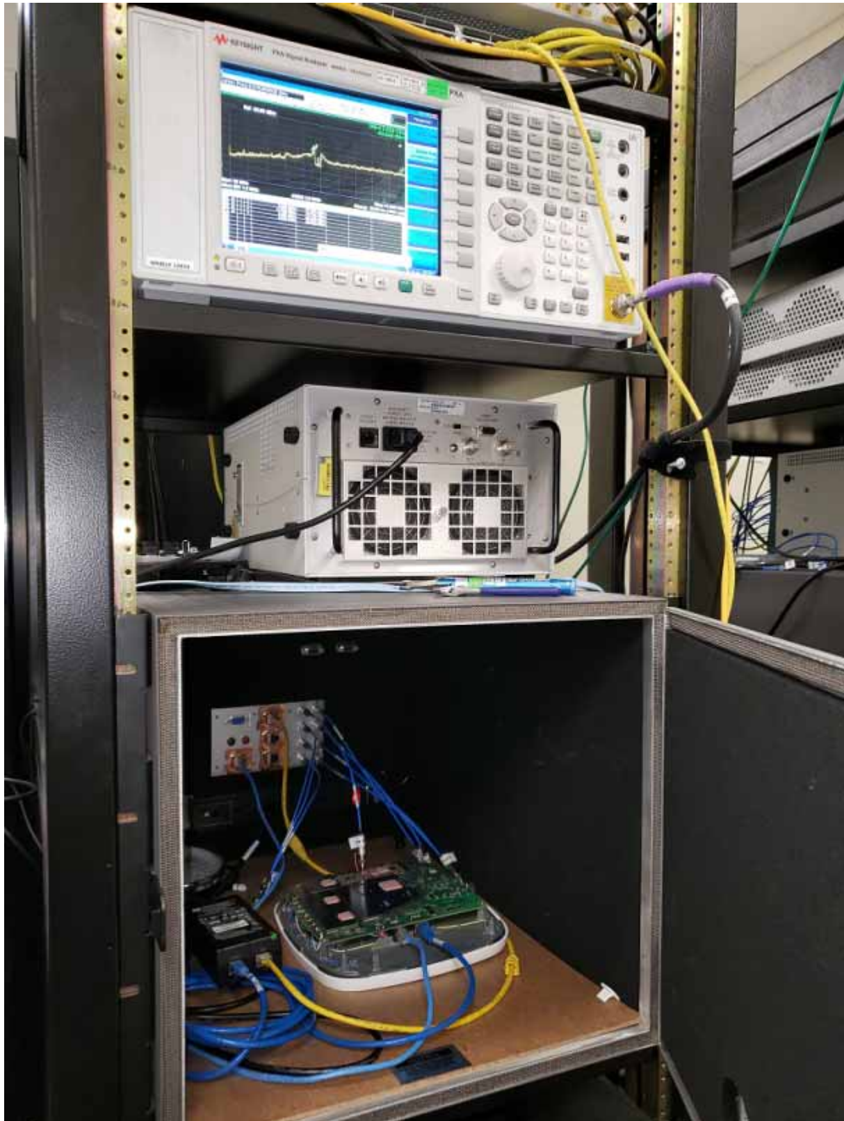
Title: Radio Conducted Test Setup