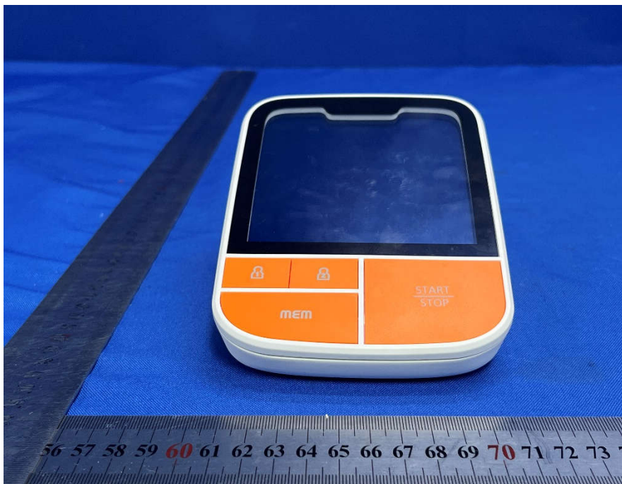
View of Product-07