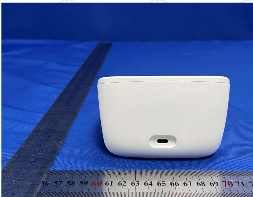
View of Product-06