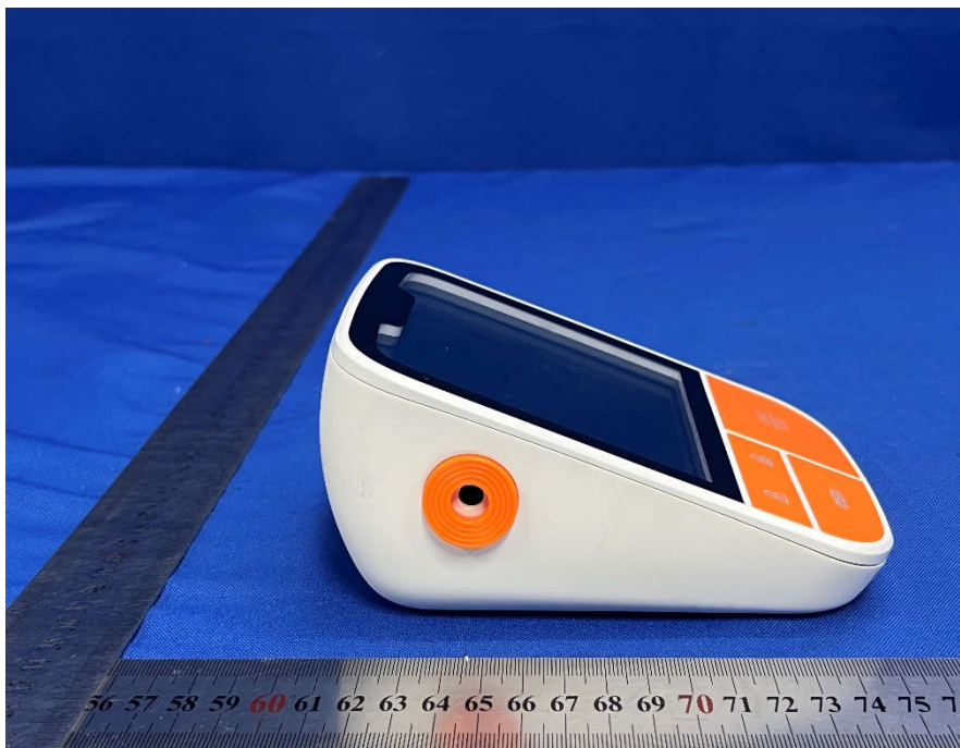
View of Product-05