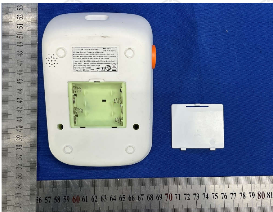
View of Product-08