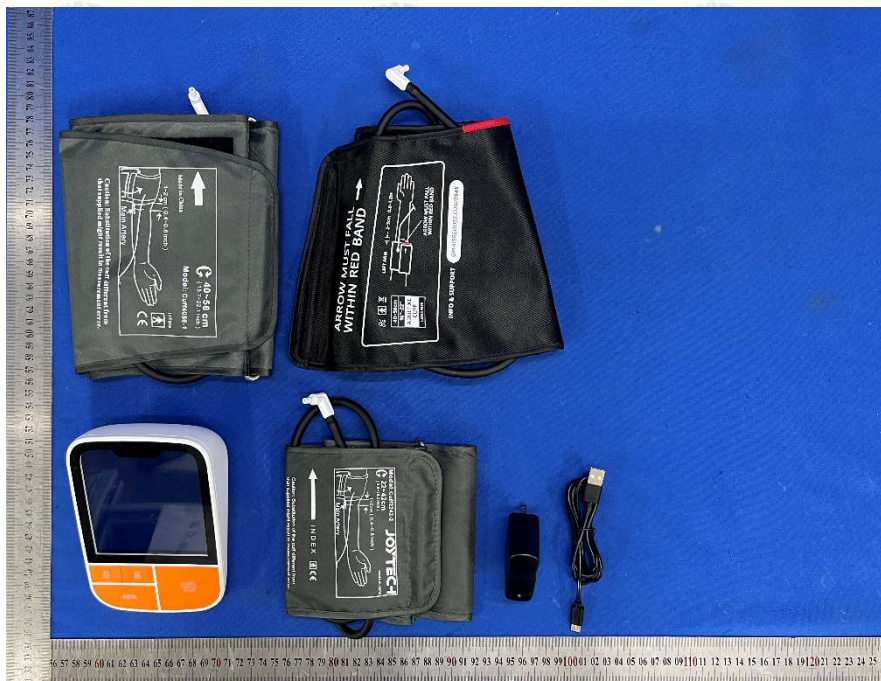
View of Product-01