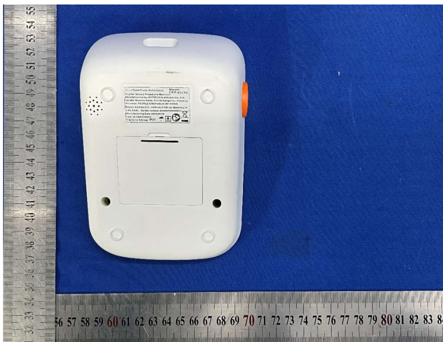
View of Product-03