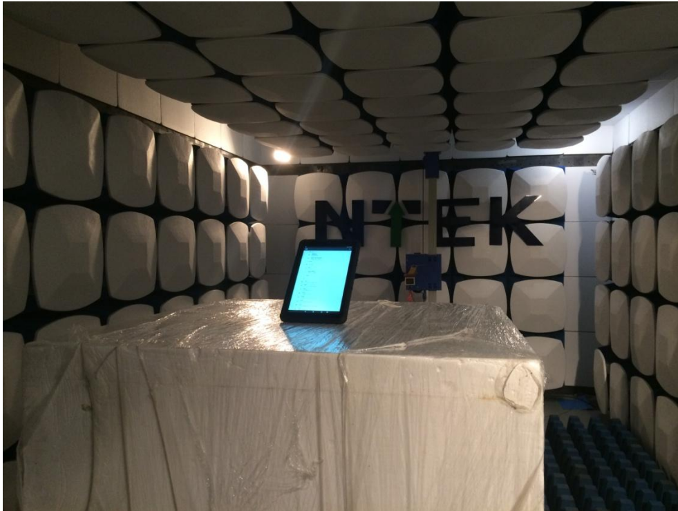
AC Conducted Measurement Photos