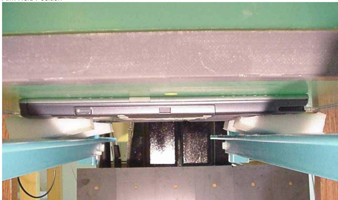
Arm Held Position