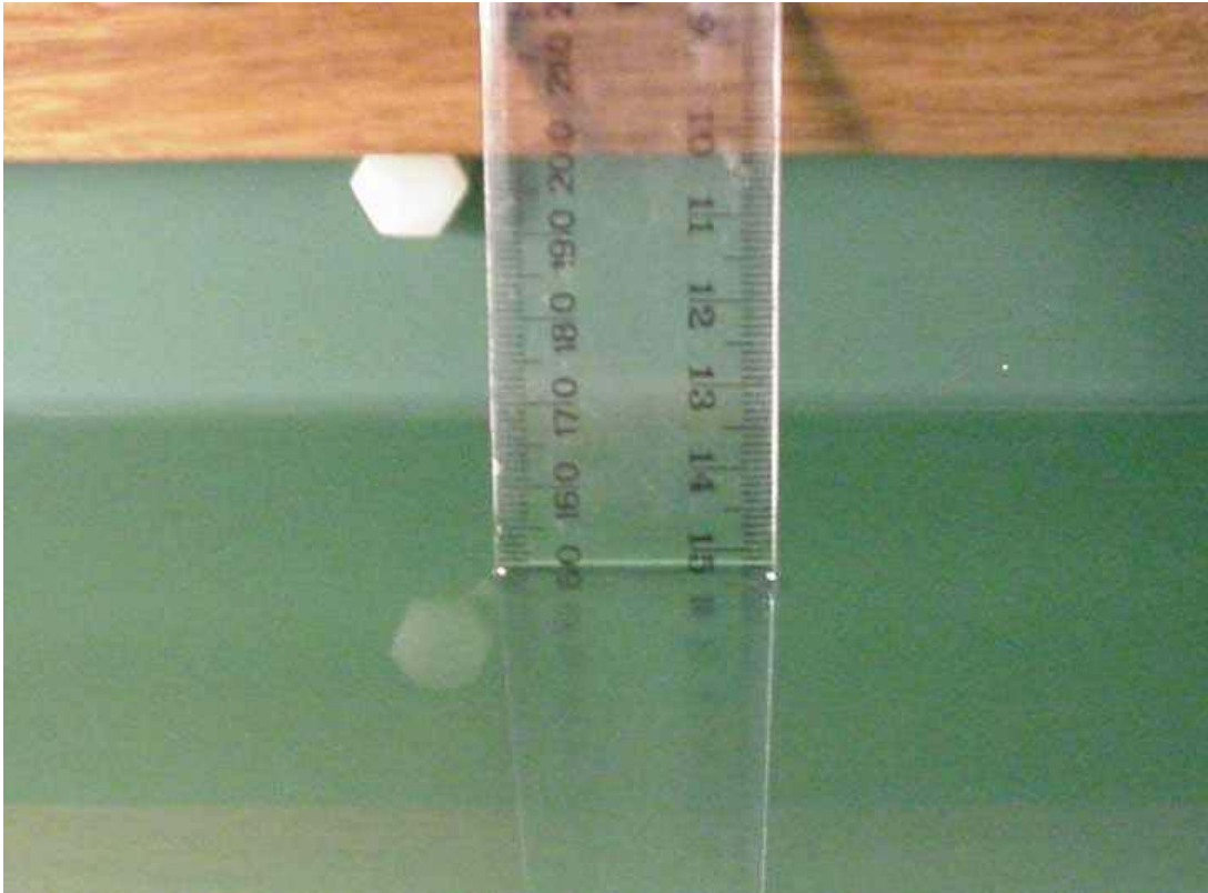
Photo of liquid Depth in Flat Phantom

During the SAR measurement process the liquid level was maintained to a level of 15cm with a tolerance of 0.5cm.