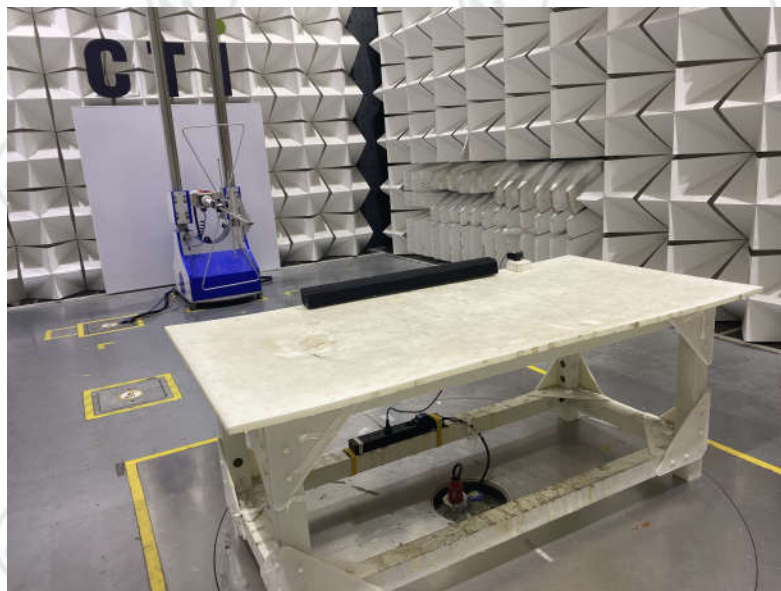
Radiated spurious emission Test Setup-2 (Below 1GHz)