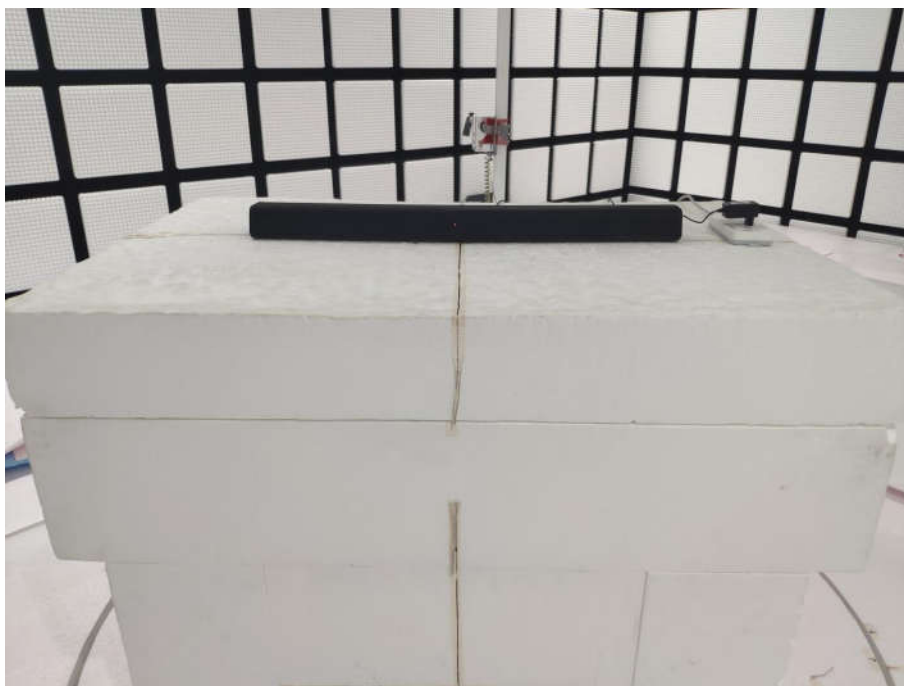
Radiated spurious emission Test Setup-3(Above 1GHz)