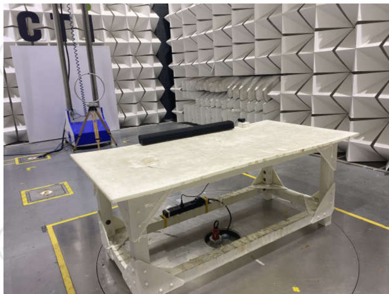
Radiated spurious emission Test Setup-1 (Below 30M)