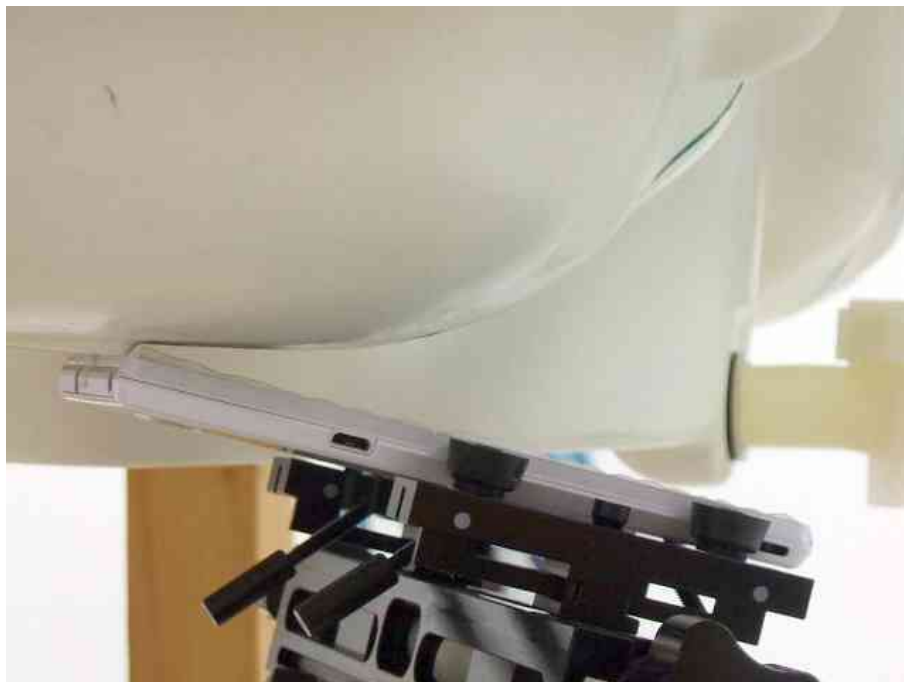
– Ear-Tilt Position –