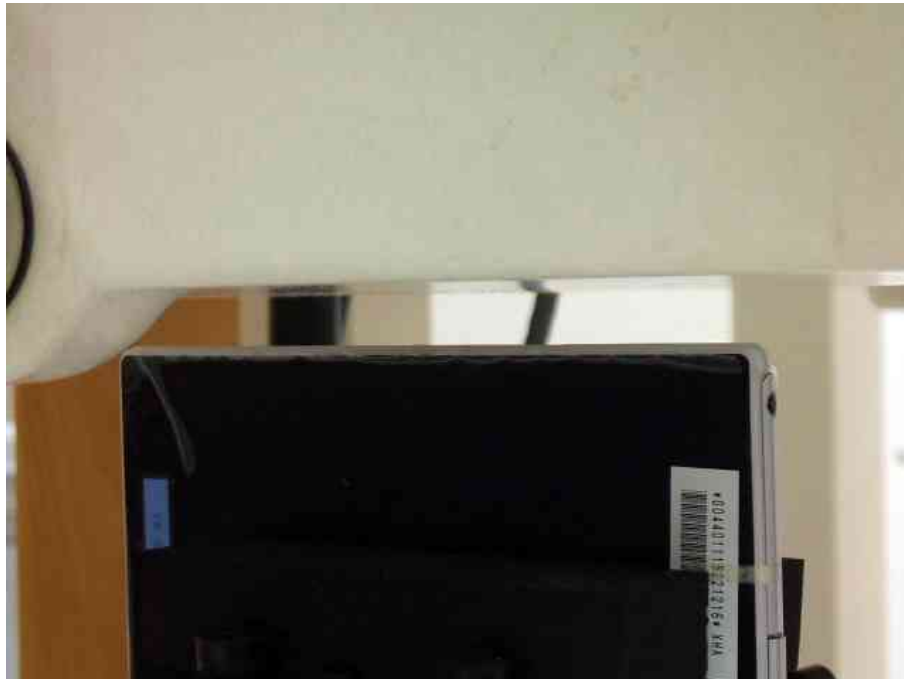
– Left Edge –