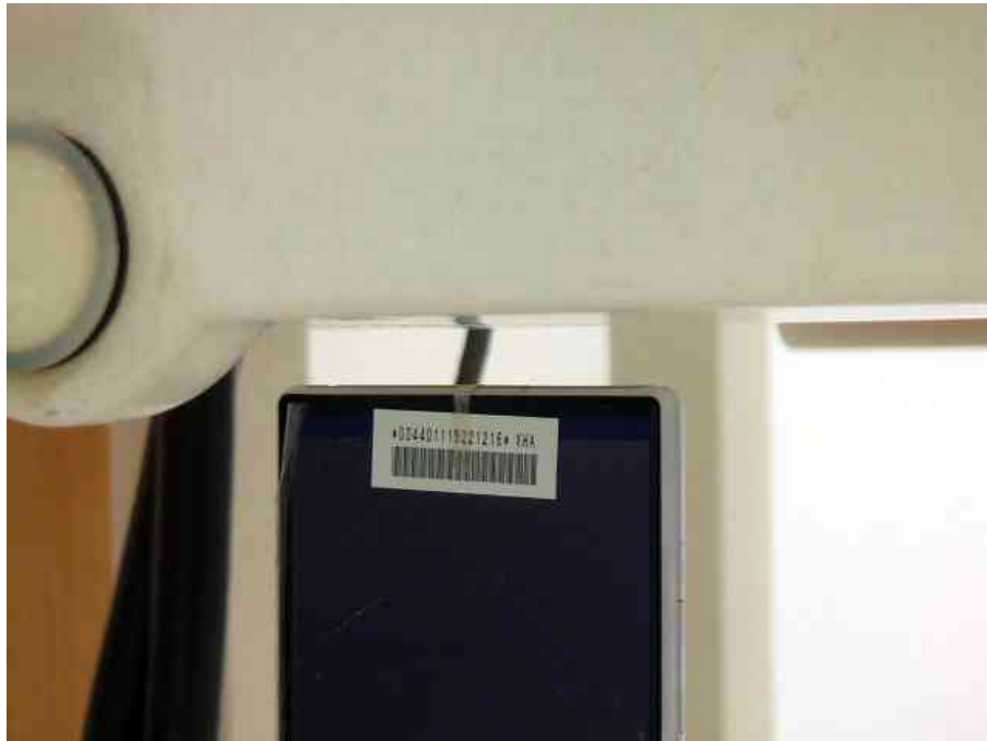
– Top Edge –