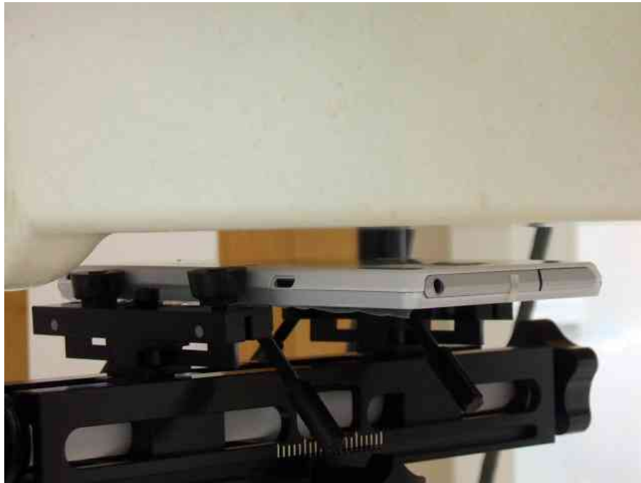
– Rear –