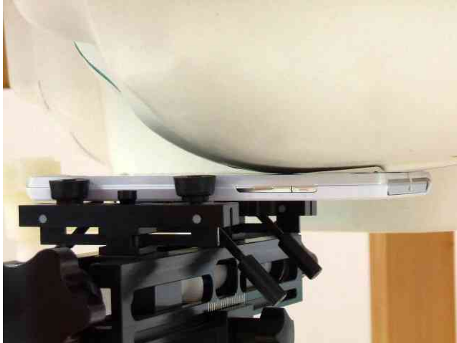
– Cheek-Touch Position –