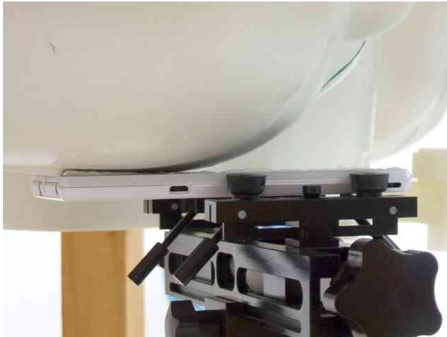
– Cheek-Touch Position –