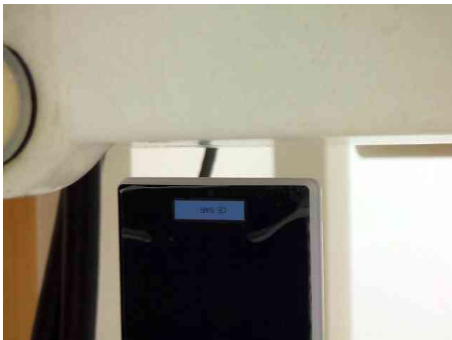
– Bottom Edge –