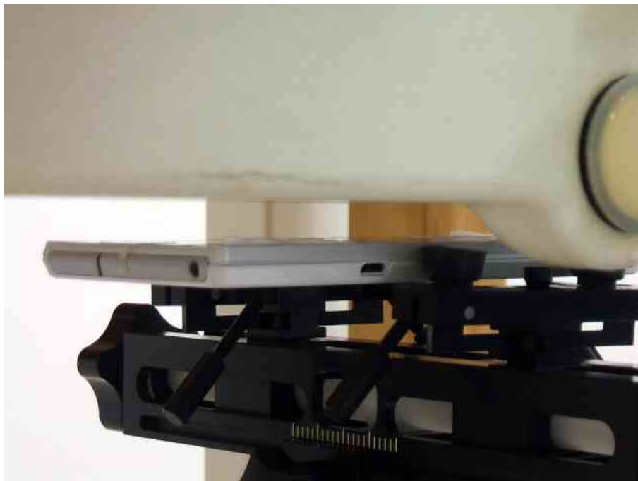
– Front –