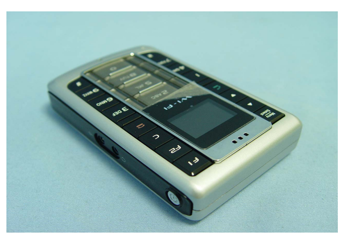
Page 1 Total Page: 8