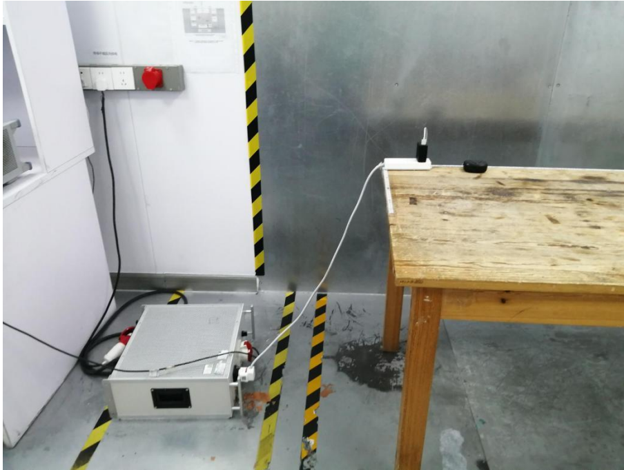
Emissions in frequency bands (below 1GHz)