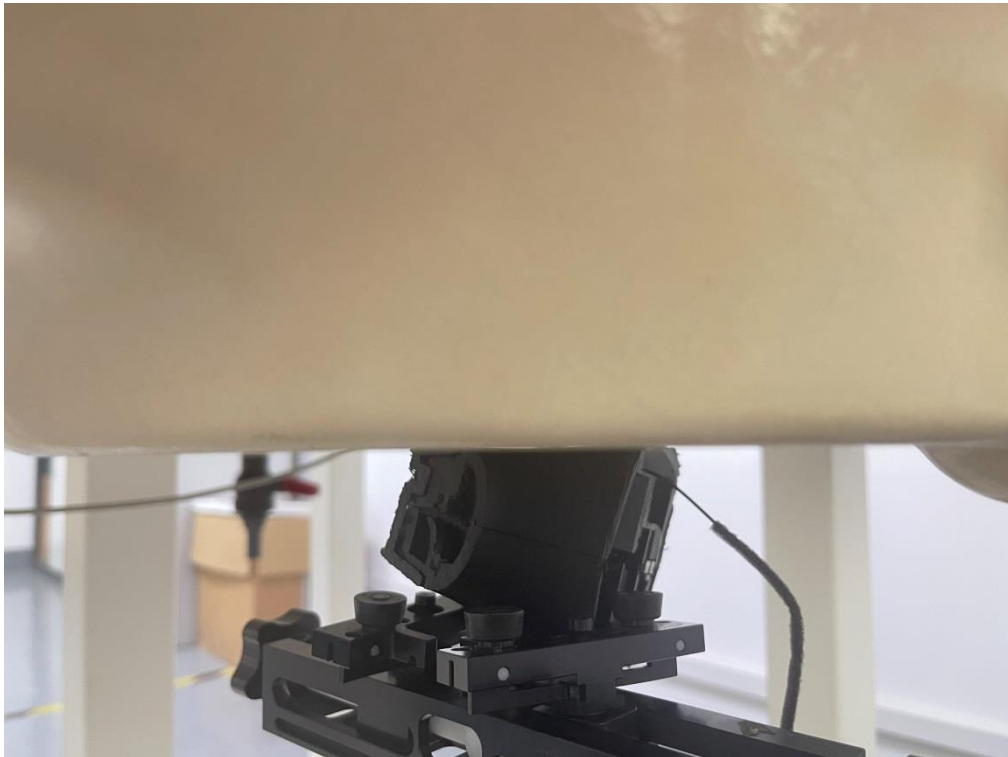
Antenna Location: (the back view)