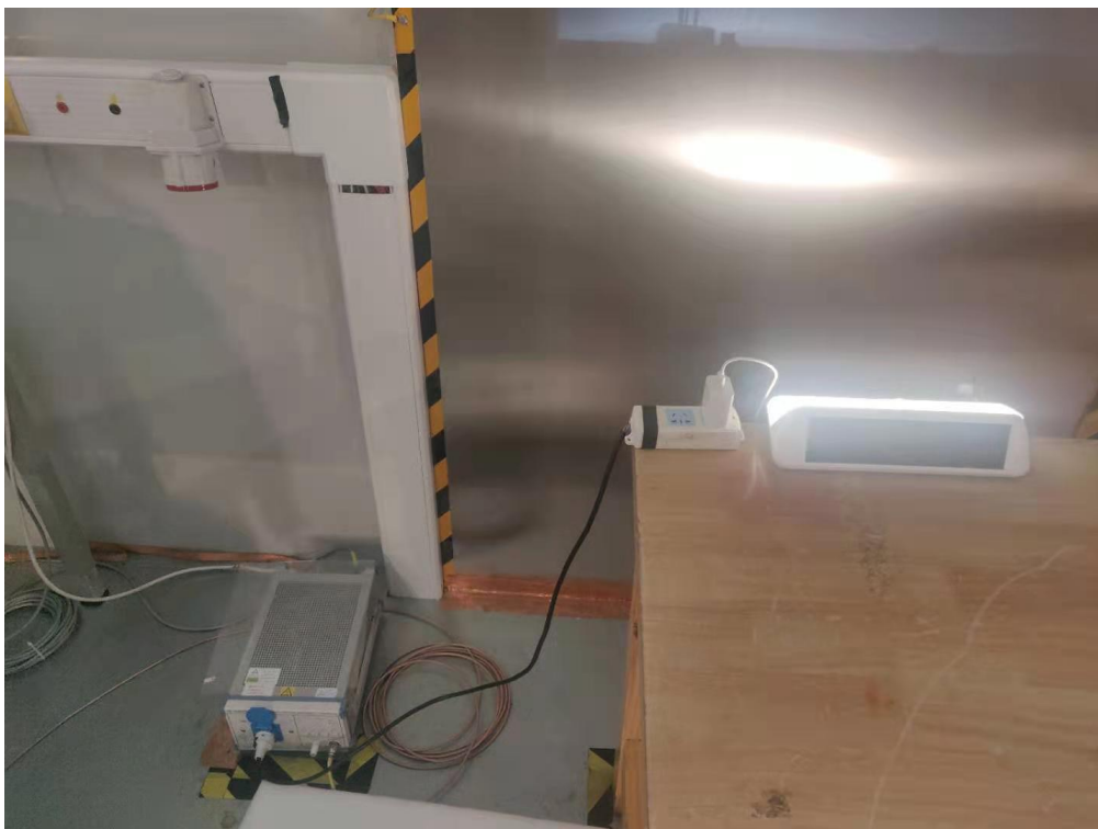
Type designation: 5D22E5

Set-up for Radiated Emission, above 1GHz