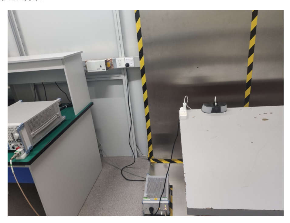
RF Conducted Emission