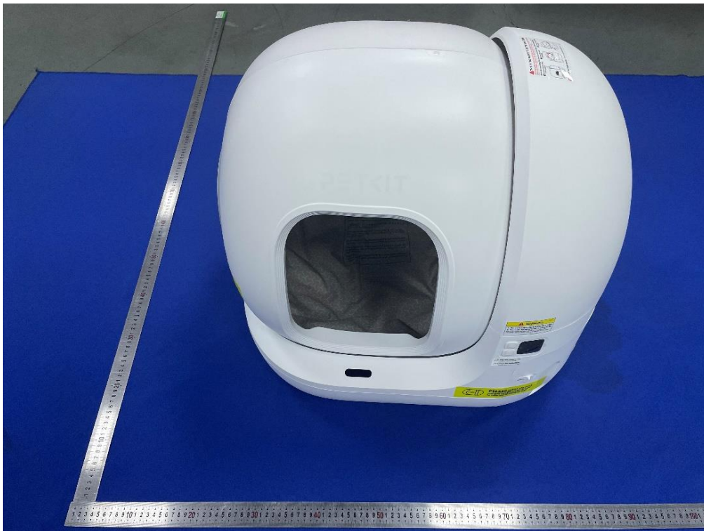
Front of the sample