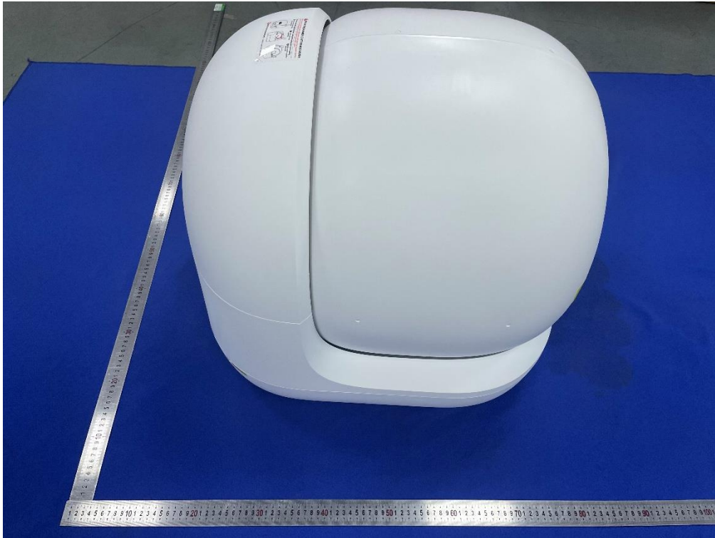
Rear of the sample