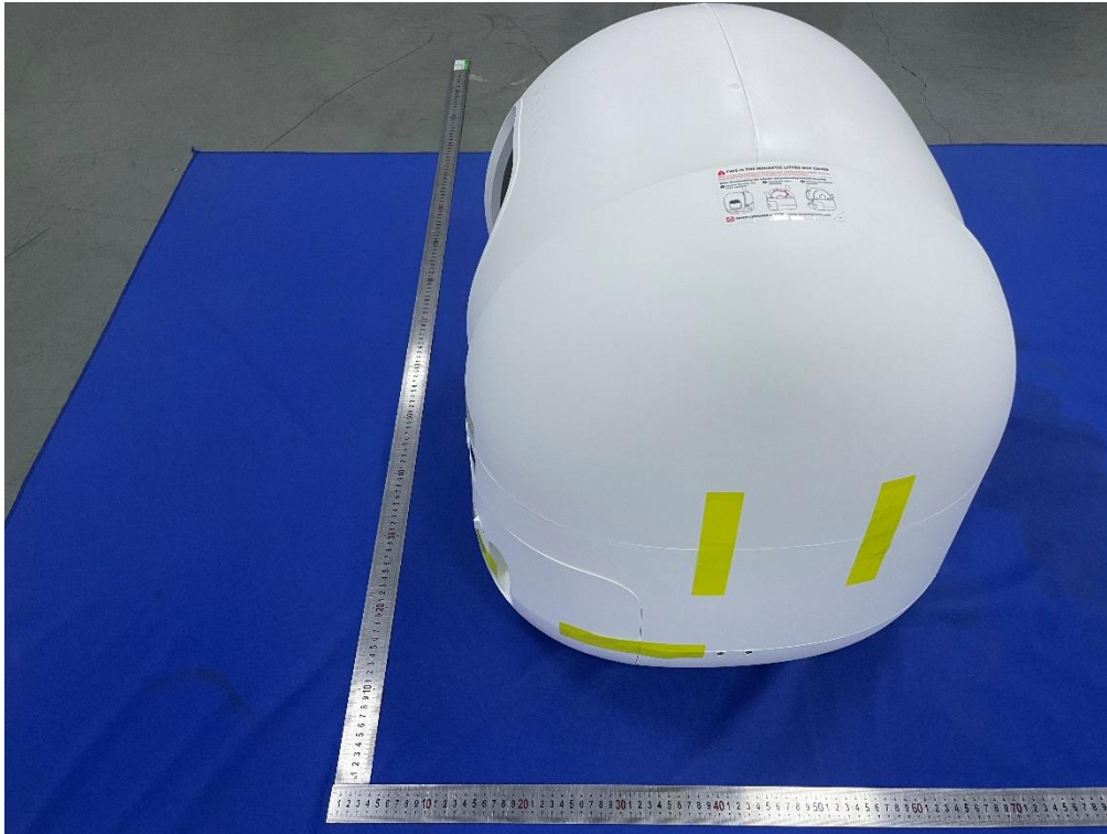
Right of the sample