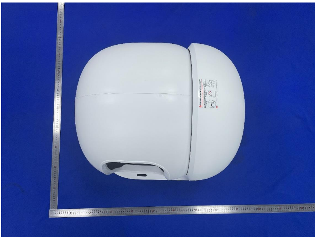
Top of the sample