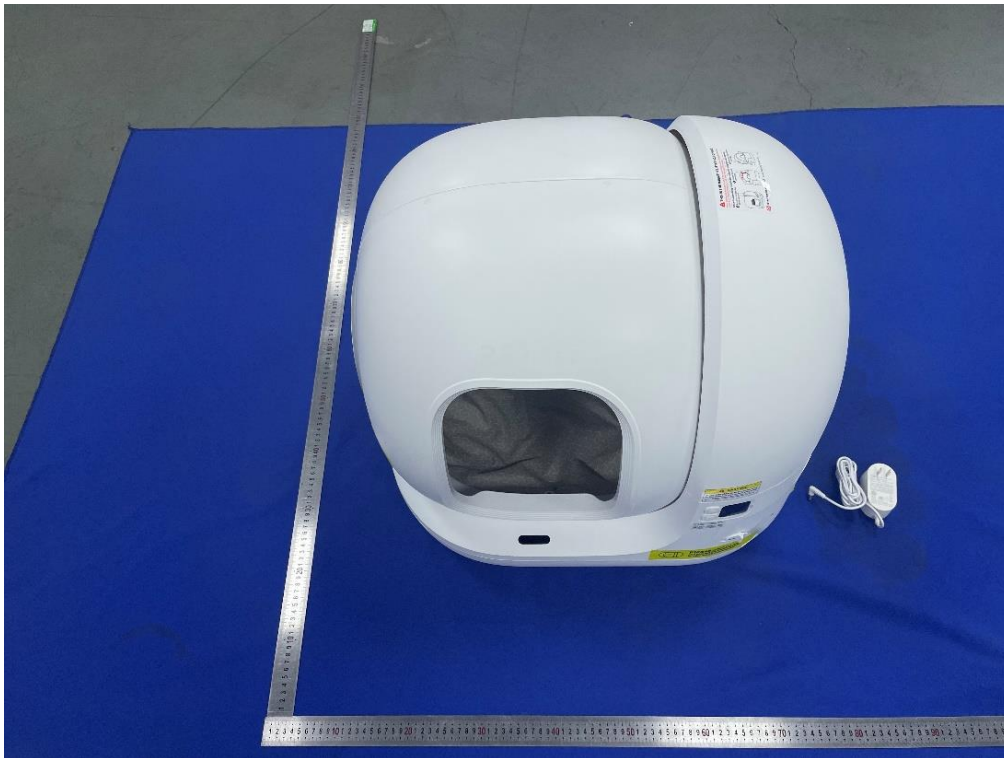
All of the sample