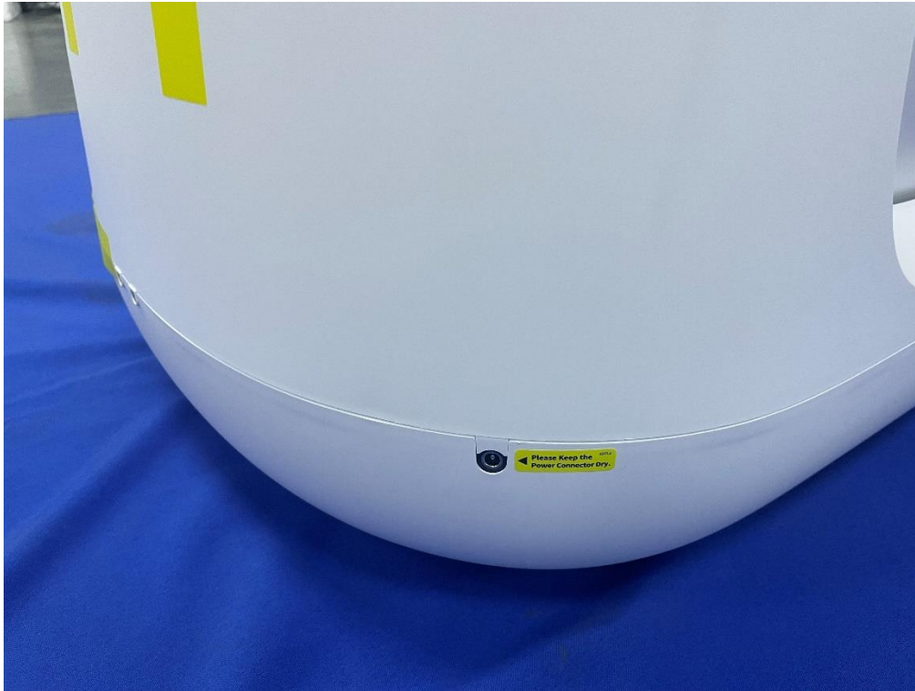
Input Port of the sample