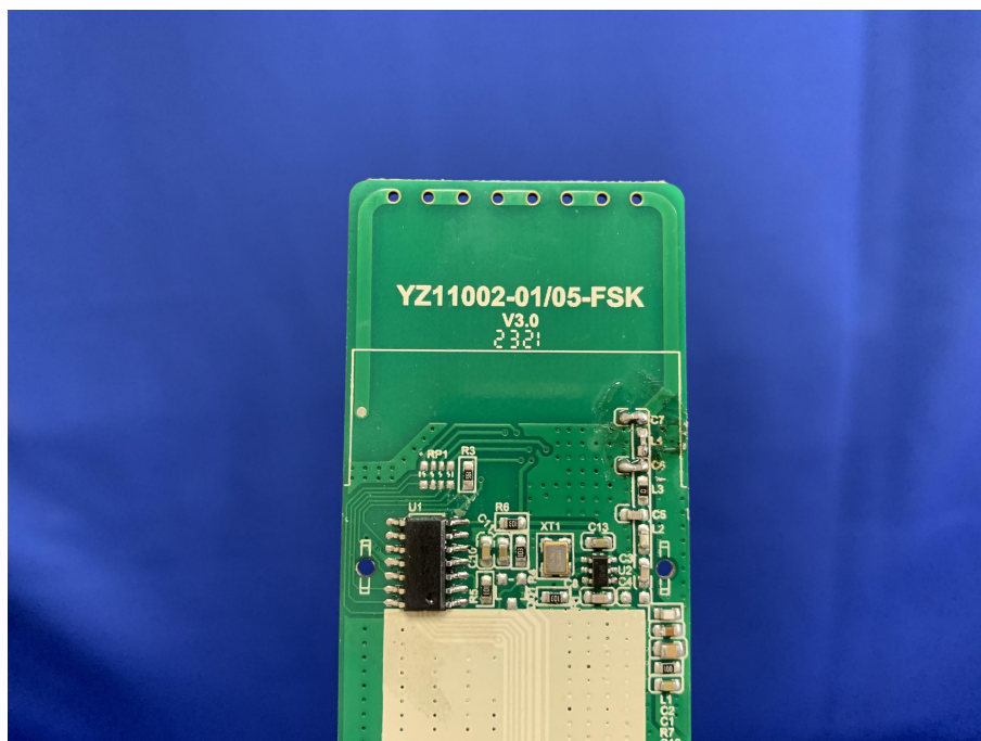
View of Product-13