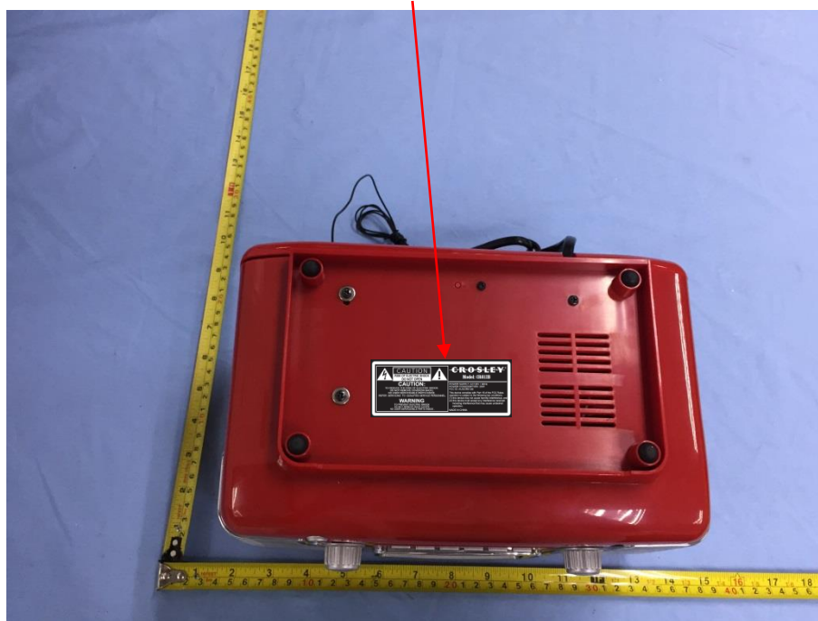
FCC ID Label Location