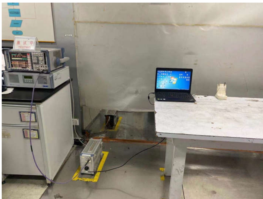
Conducted Emissions Test Setup-7