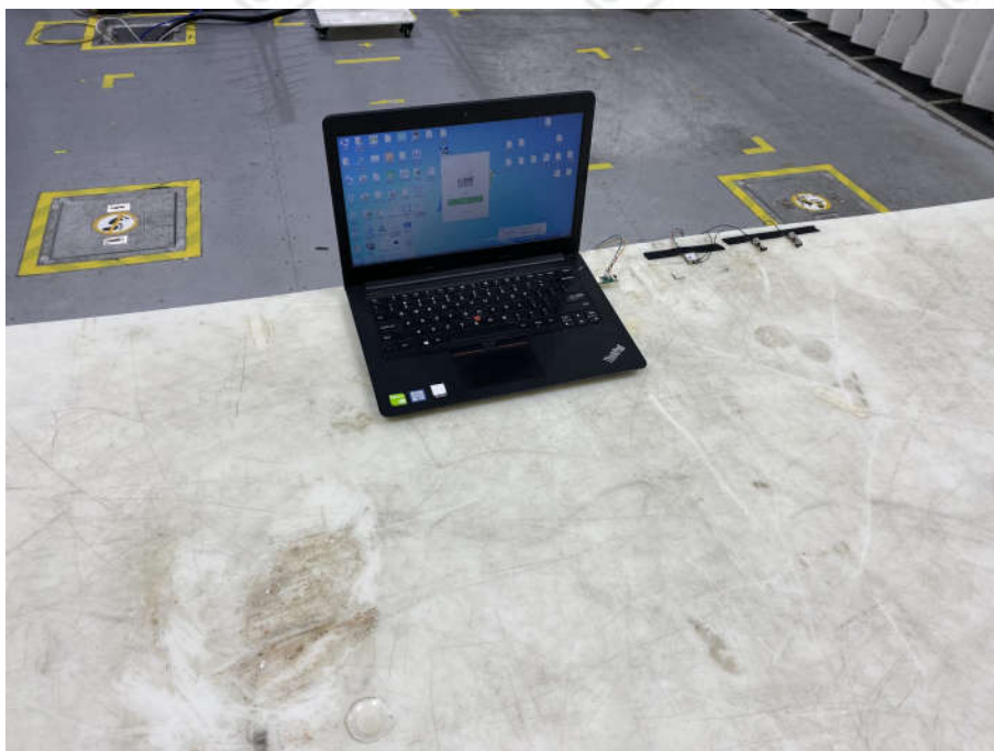
Radiated spurious emission Test Setup-1-2(Below 30MHz)