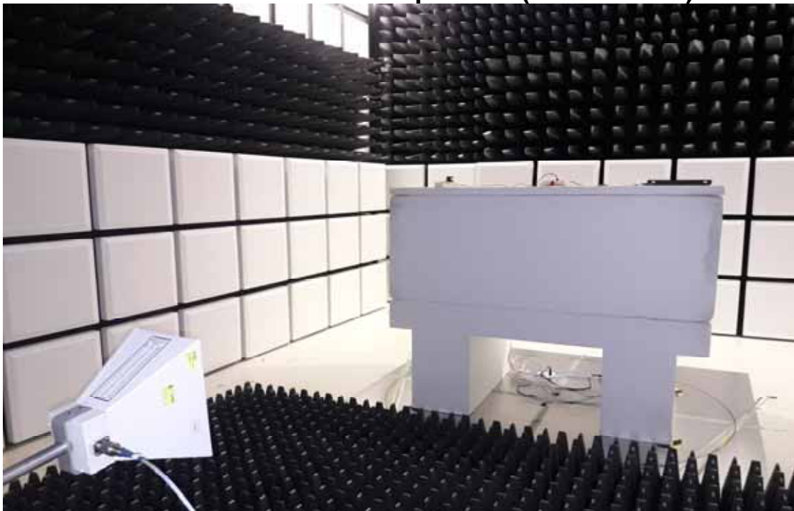
Radiated Emission Set up Photo (Front View)