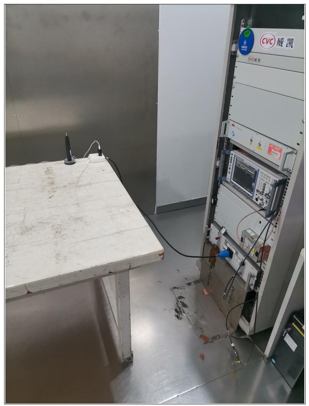
CONDUCTED EMISSION TEST