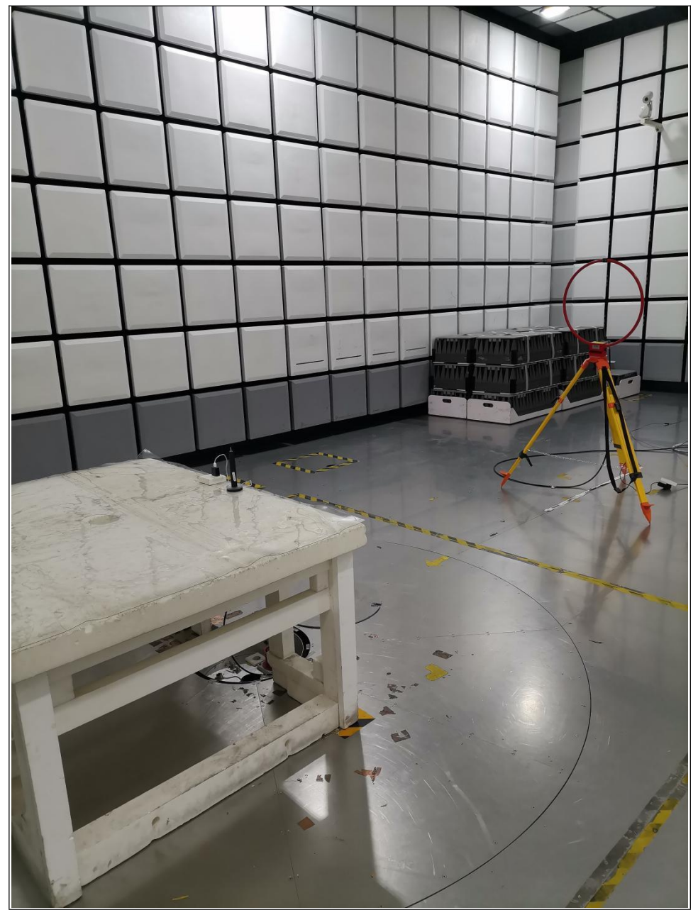
RADIATED EMISSION TEST (Below 30MHz)