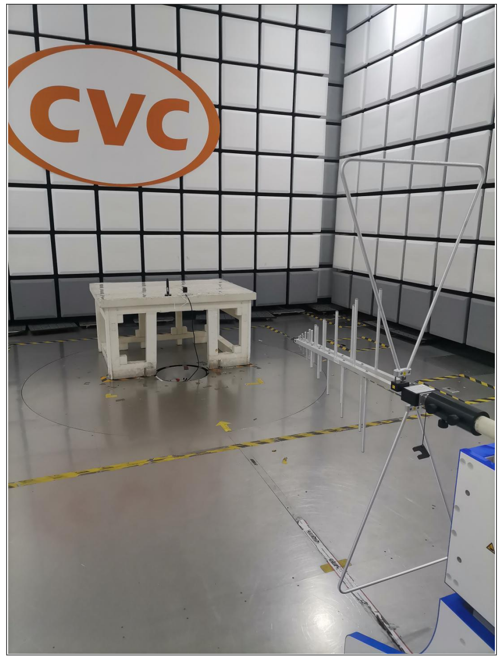
RADIATED EMISSION TEST (Below 1GHz)