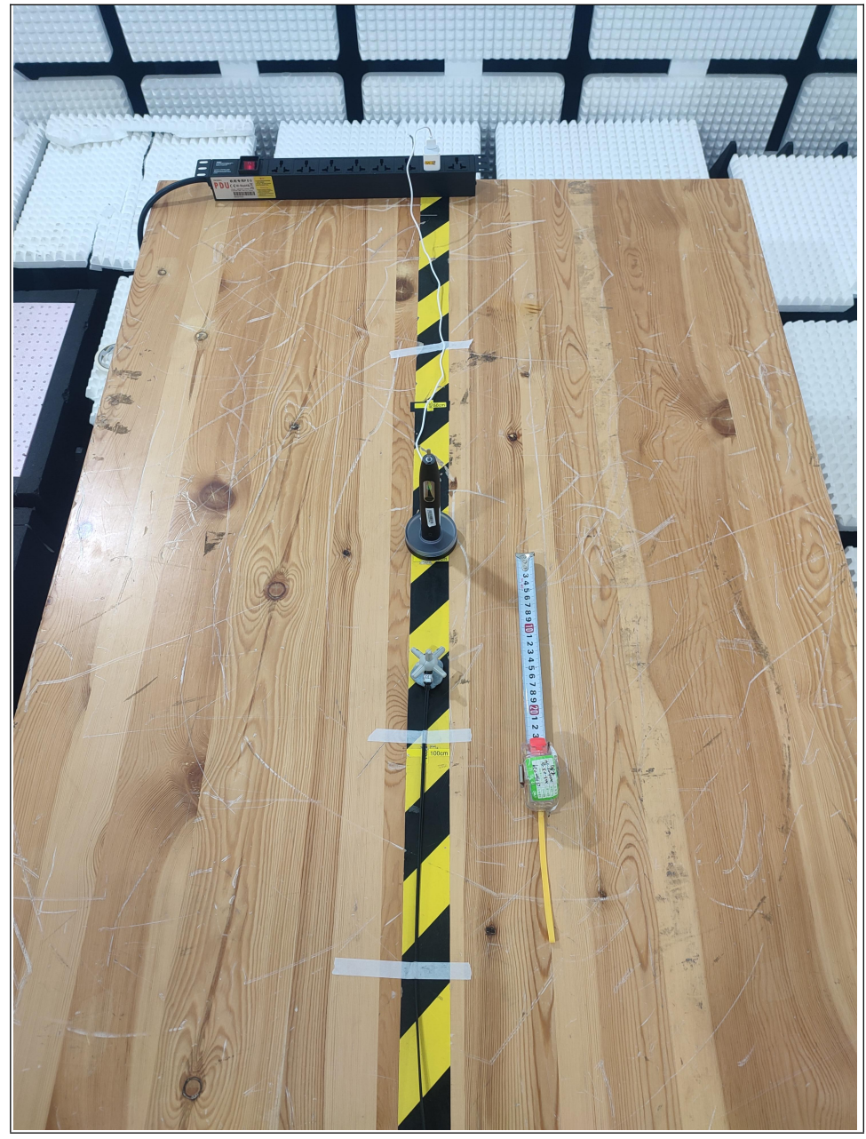
Electric Field Emissions_TEST DISTANCE 15cm