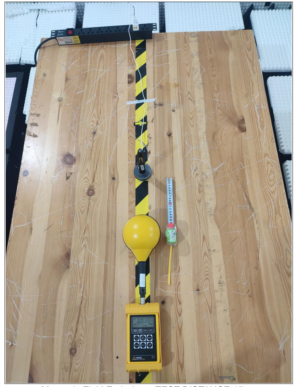
Magnetic Field Emissions_TEST DISTANCE 15cm