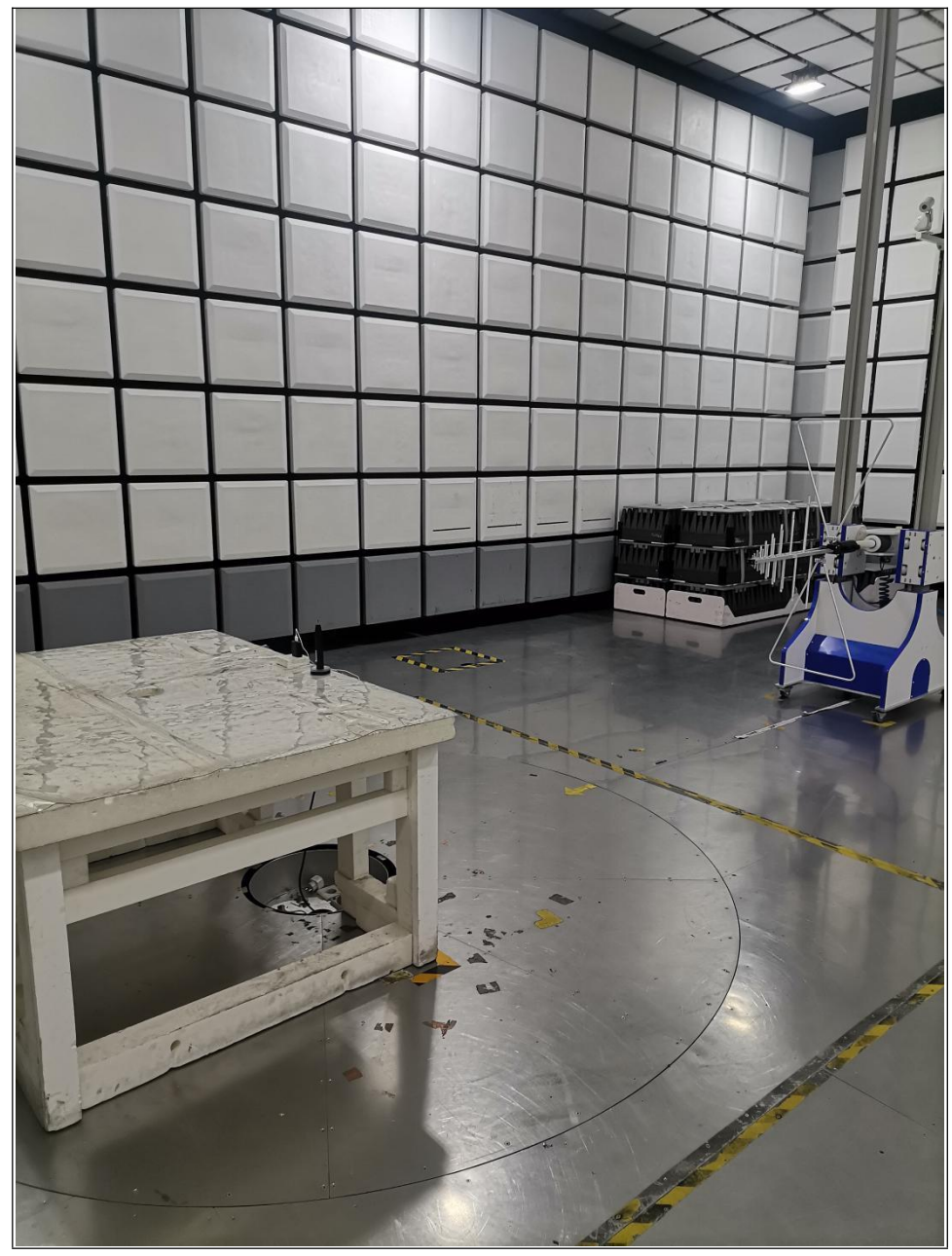
RADIATED EMISSION TEST (Below 1GHz)