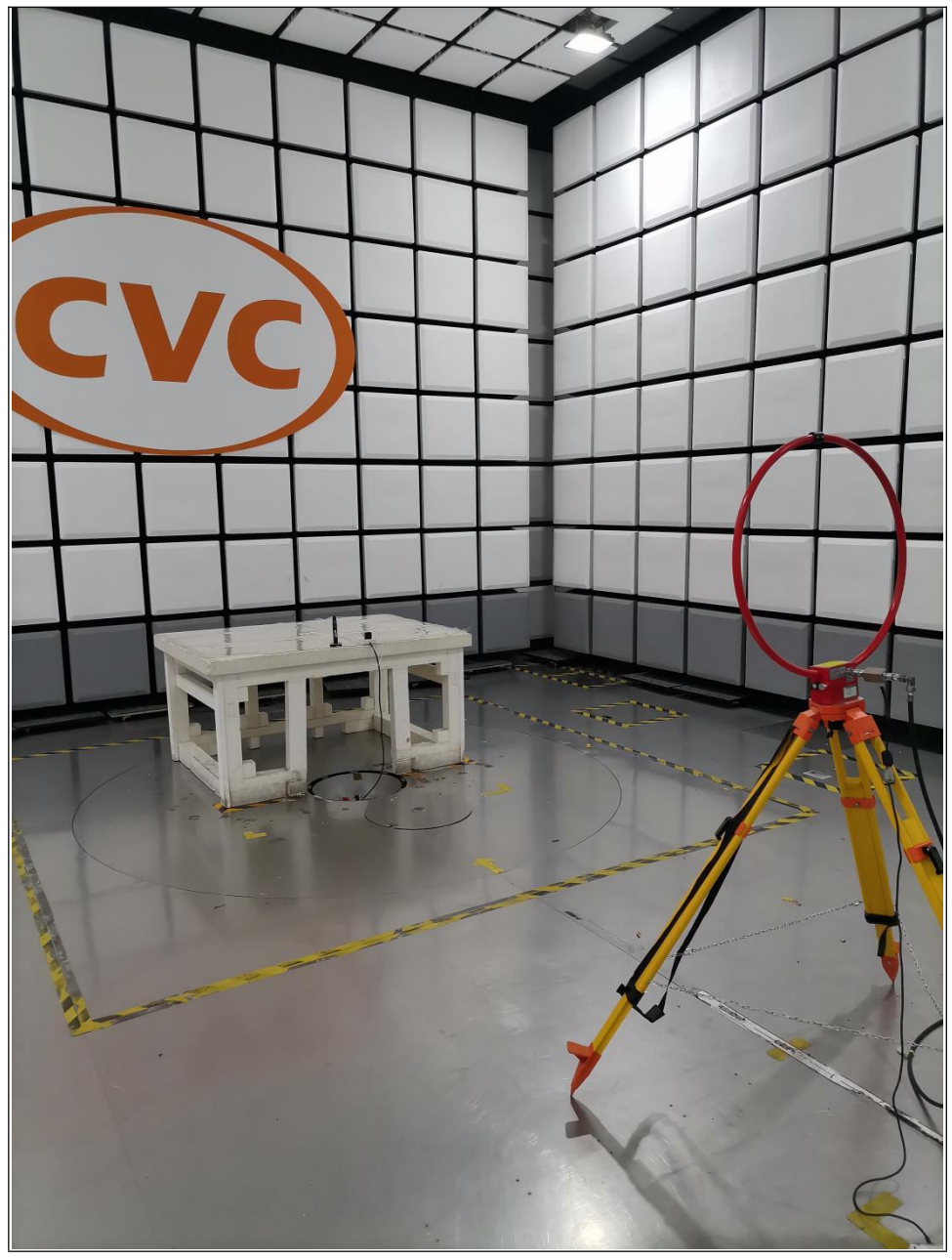
RADIATED EMISSION TEST (Below 30MHz)