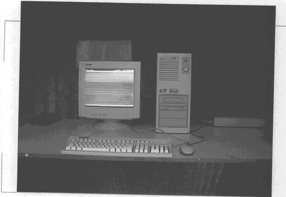
Front View of Radiated Measurement