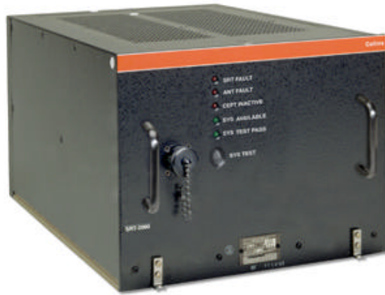
Figure 1.1 SRT-2000 Satellite Transmitter/Receiver

The SDU function of the SRT-2000 is the interface to all other aircraft systems. It contains all data processing functions, modems and channel tuning synthesizers including a voice CODEC (coder-decoder) and synthesizer pair for each voice channel.