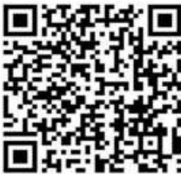
For Andriod Device