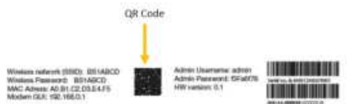
BW1600A Sample Label