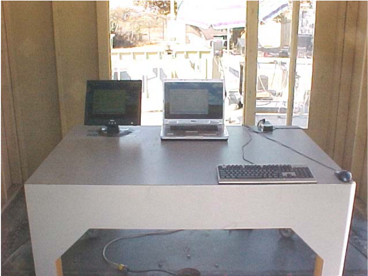
Radiated Emissions Measurement (1-26.5 GHz) (Front View) Setup