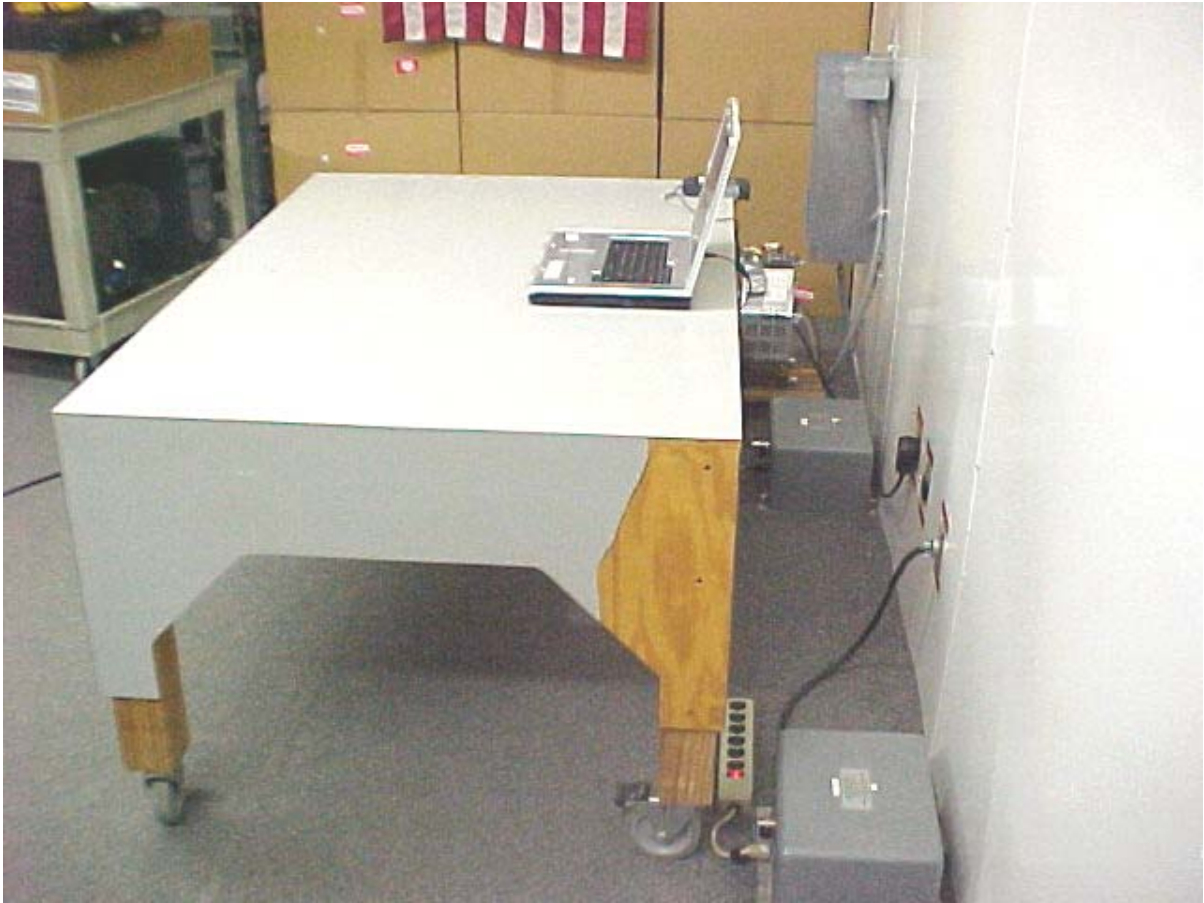
AC Conducted Emissions Measurement (Rear View) Setup