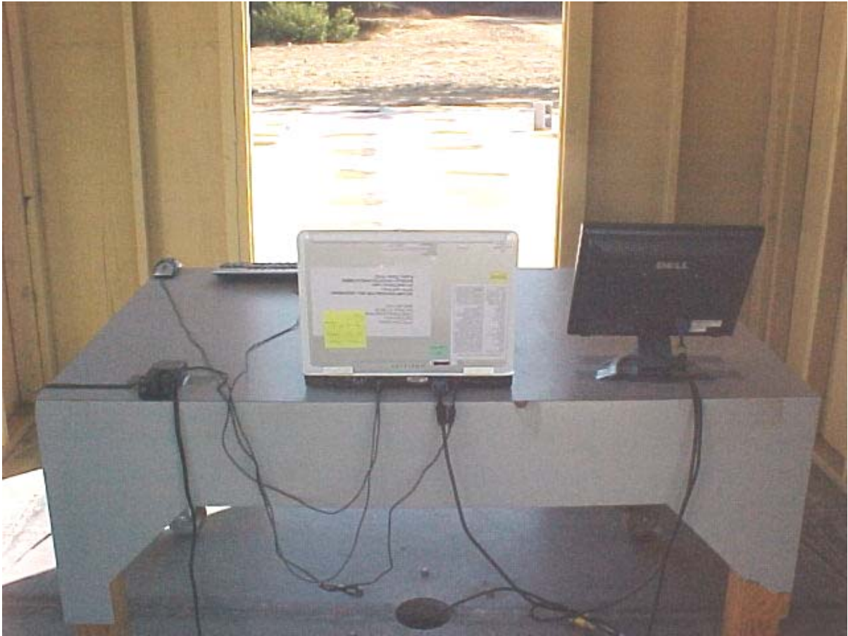
Radiated Emissions Measurement (1-26.5 GHz) (Rear View) Setup