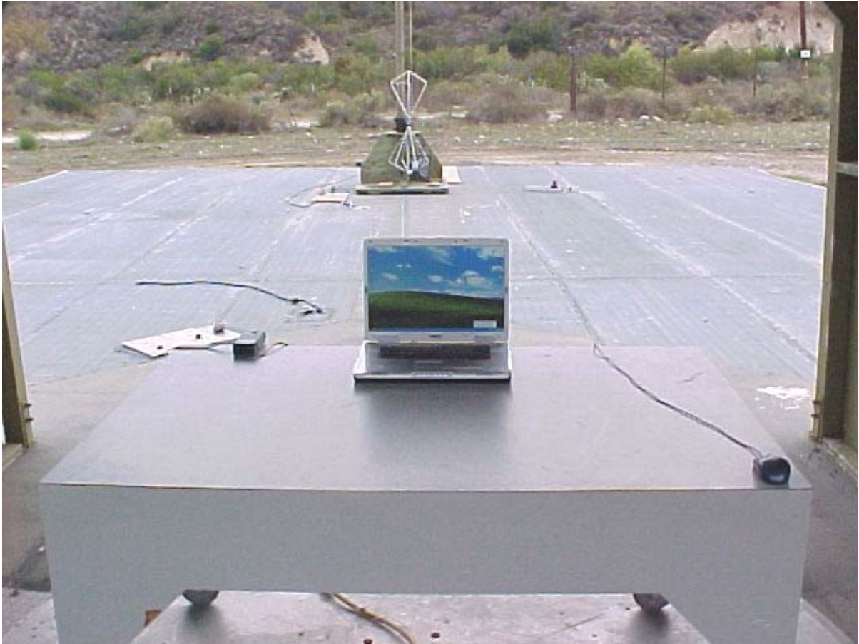
Radiated Emissions Measurement (30-1000 MHz) (Front View) Setup