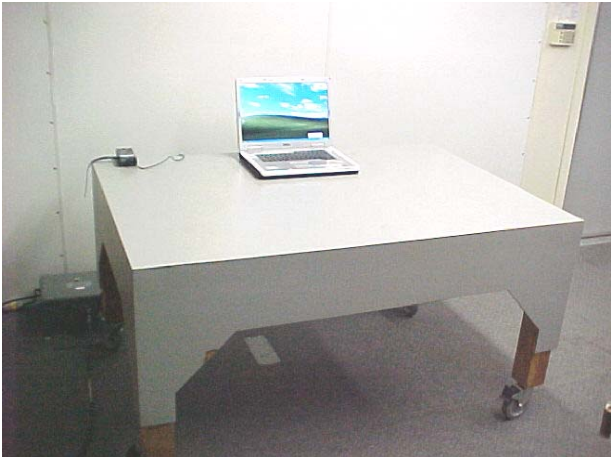
AC Conducted Emissions Measurement (Front View) Setup