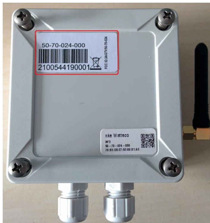
FIGURE 2 - FCC LABEL LOCATION

This label is put on the front of the device, on the casing as it can be seen on the illustration here below.