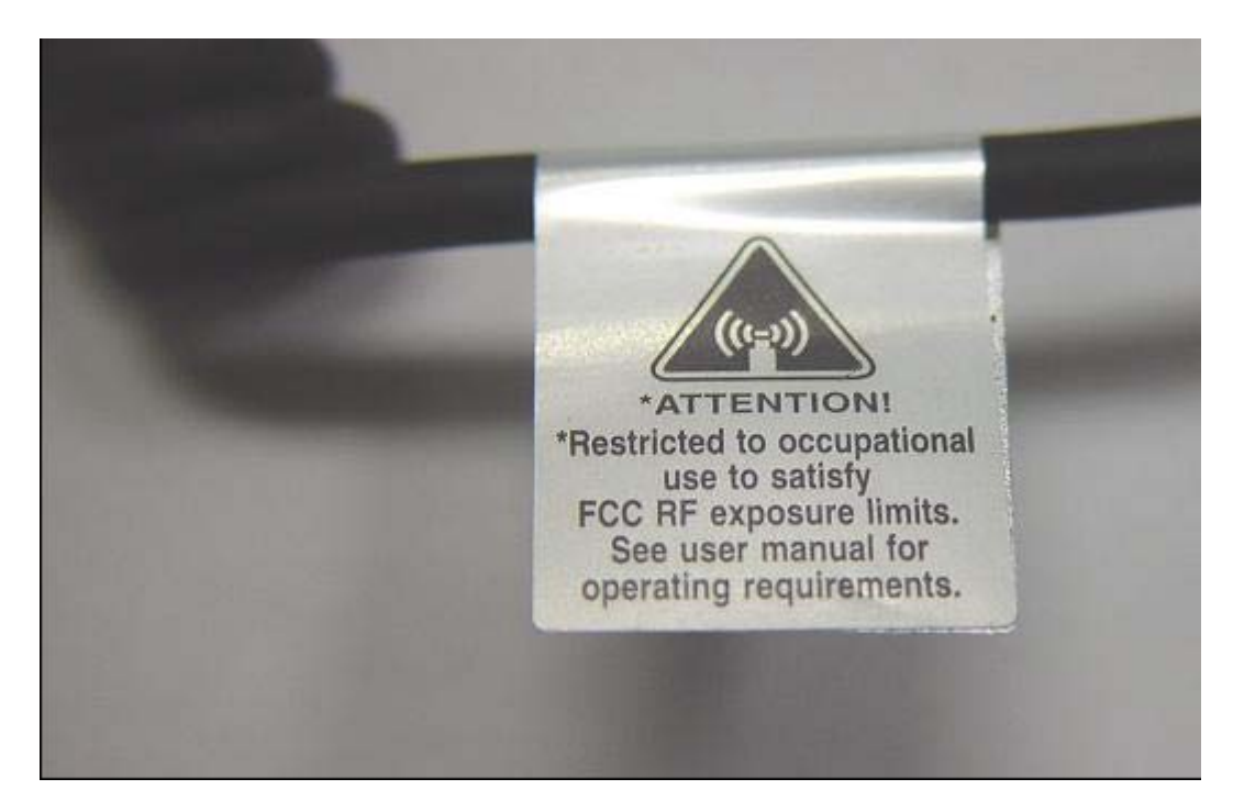
Figure 3-8: Close-Up of RF Safety Label