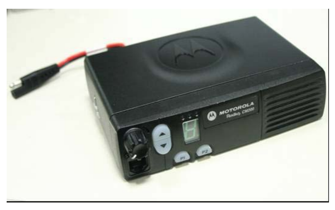
Figure 3-3: General View, CM200 model.