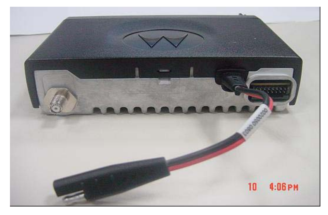
Figure 3-5: Rear View showing antenna connector, DC cable, and accessory connector.