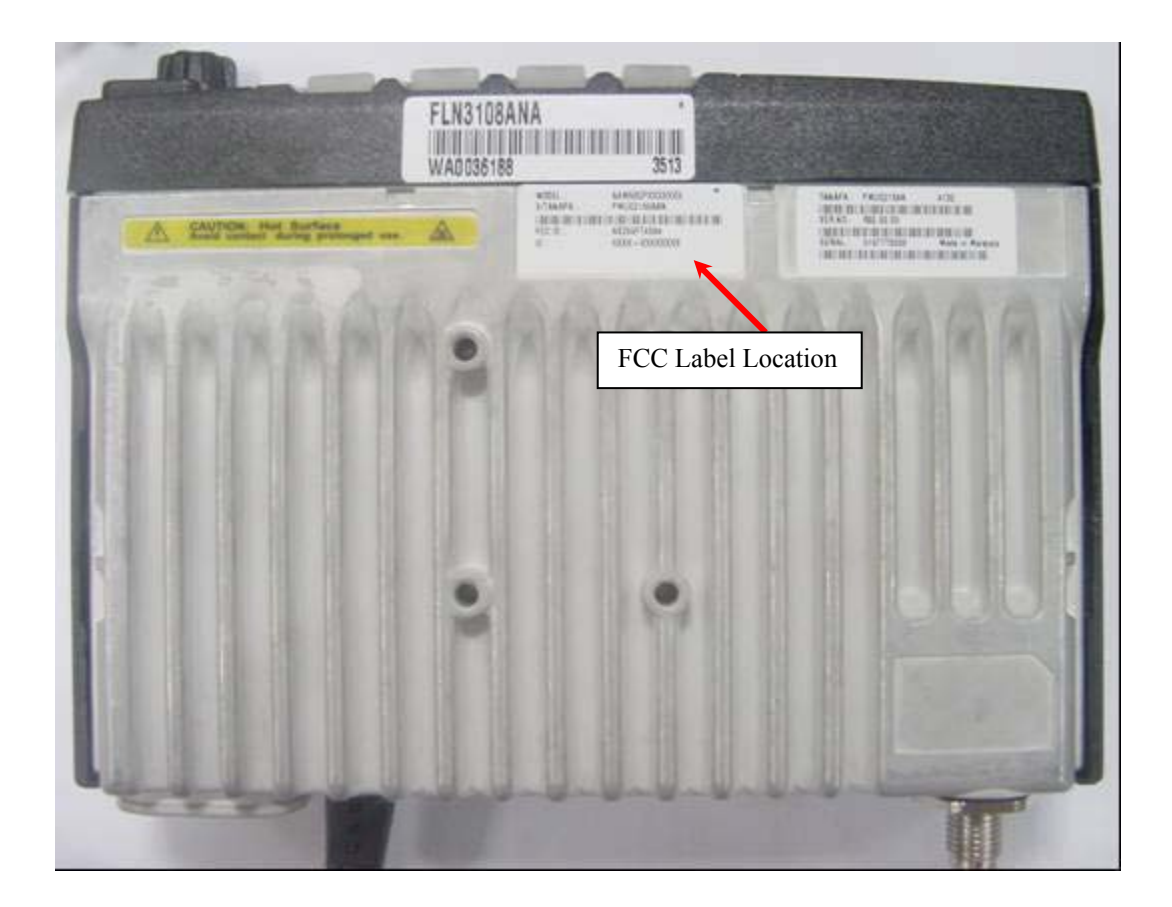
Figure 3-6: Bottom View showing location of FCC Label.