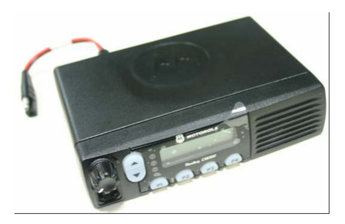
Figure 3-1: General View, CM300 model.