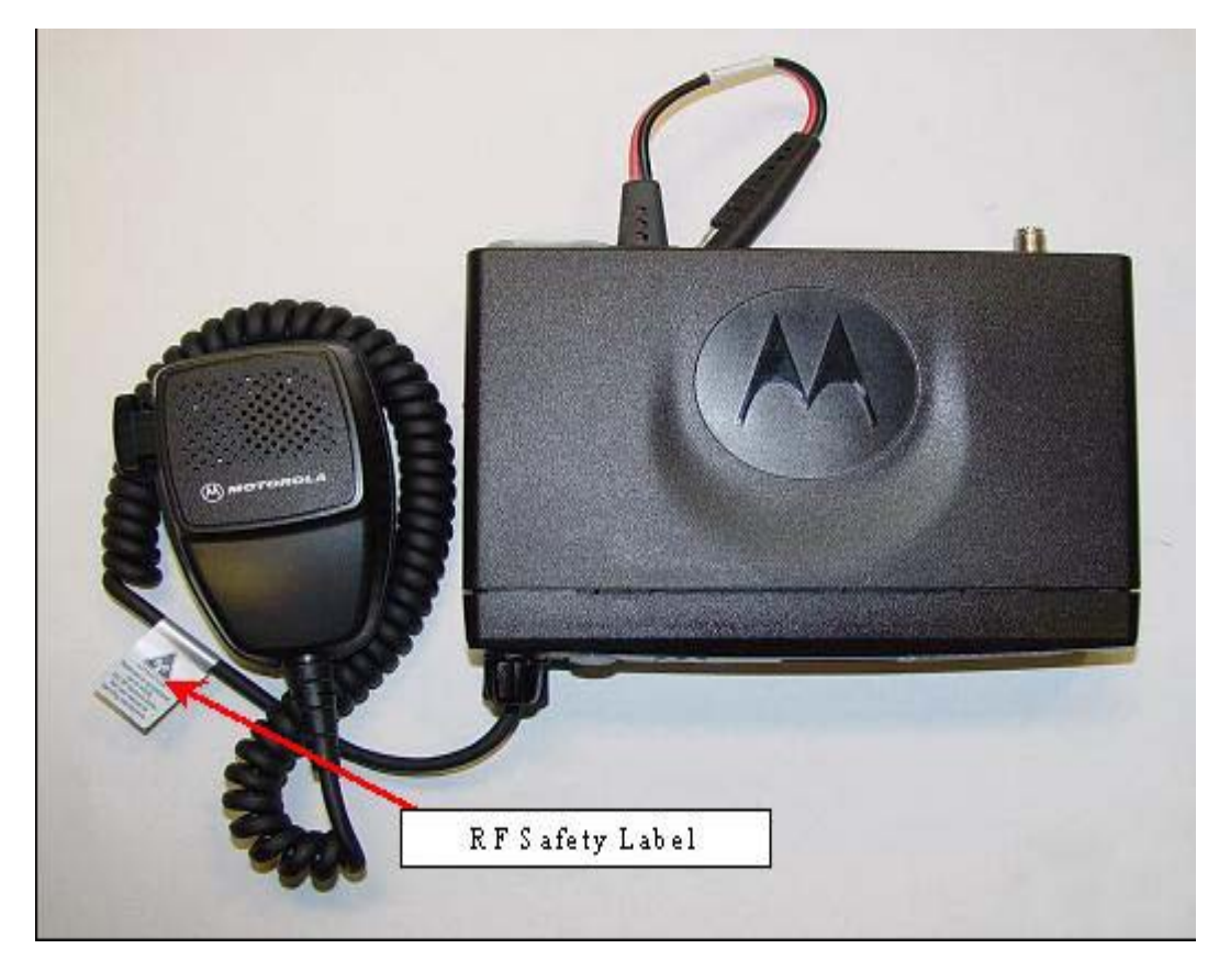
Figure 3-7: RF Safety Label Location attached to microphone cord.