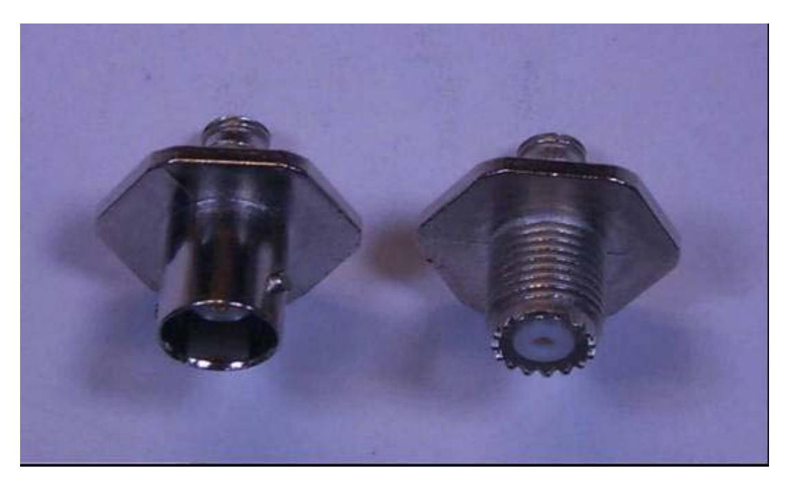
Figure 3-9: Antenna connector options, BNC (left), mini-UHF (right).