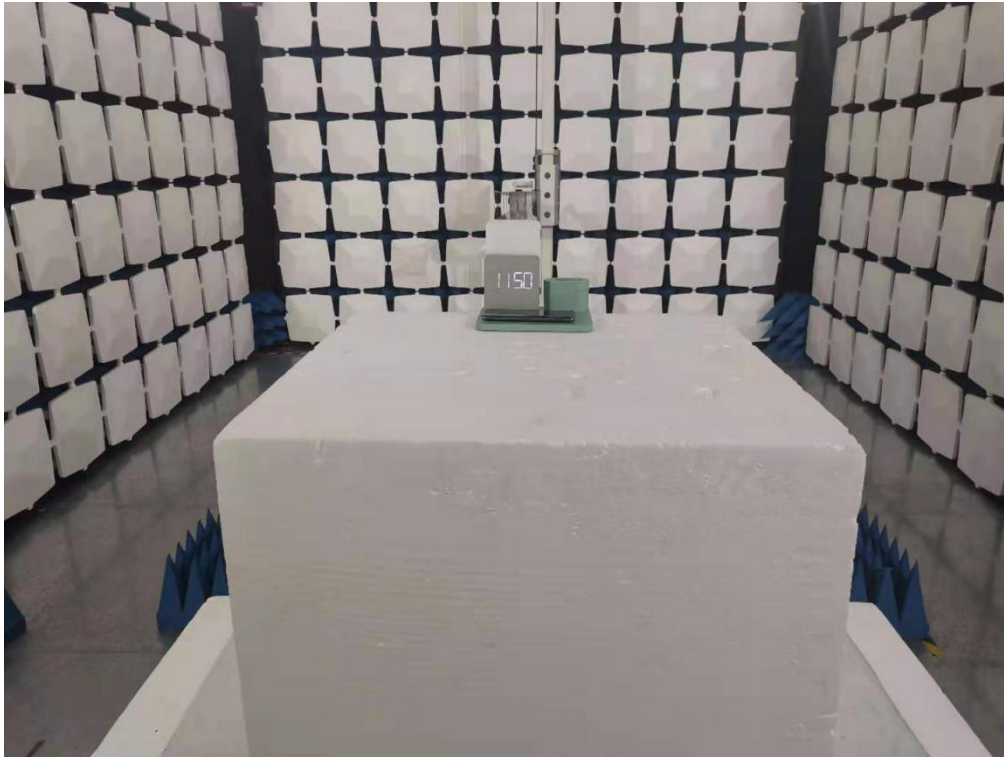
Below 1GHz for radiated emission test setup