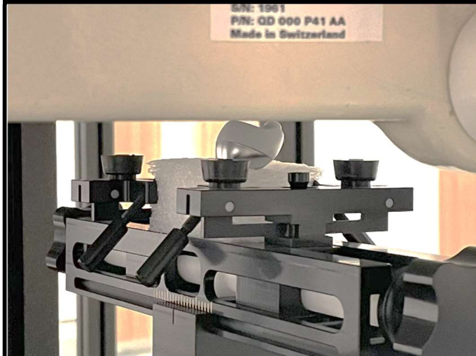
Left of Earphone with 0 cm Gap