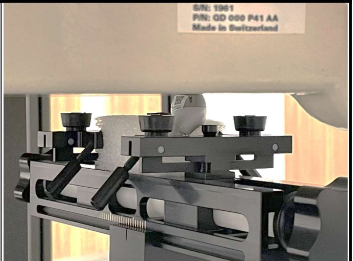
Rear Face of Left Earphone with 0 cm Gap