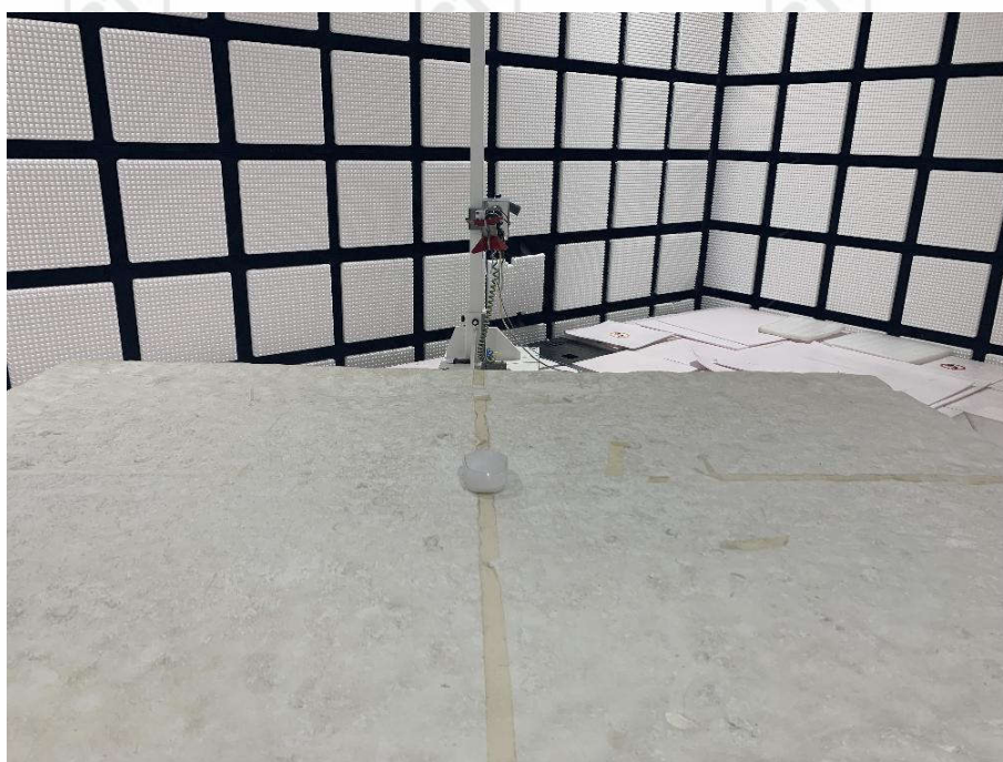
Radiated spurious emission Test Setup-2(1-18 GHz)