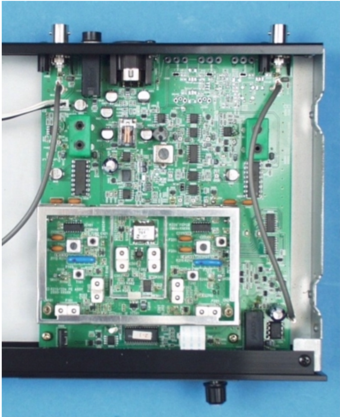
Circuit Board without Shield