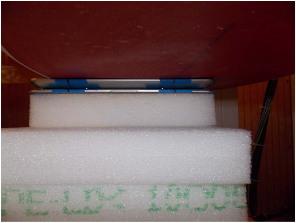
Test Position Tablet Back 0 mm Gap