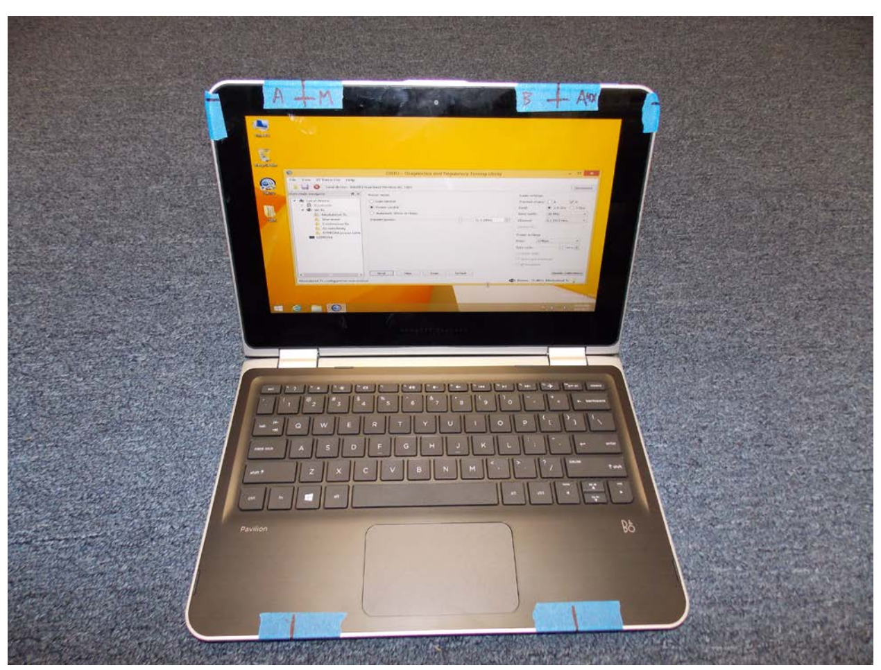
Front of Device Laptop Mode