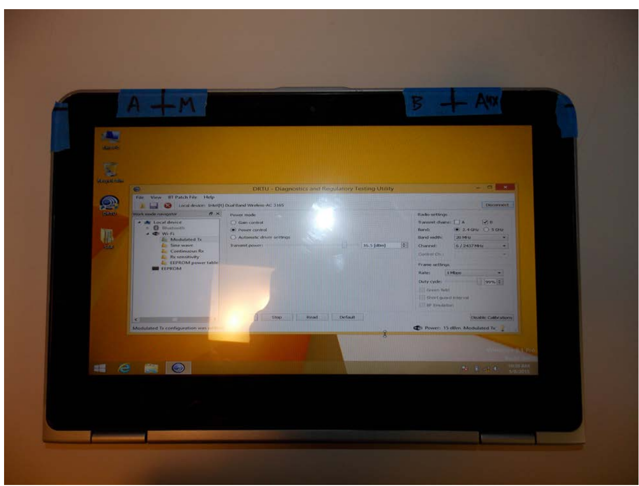
Front of Device Tablet Mode