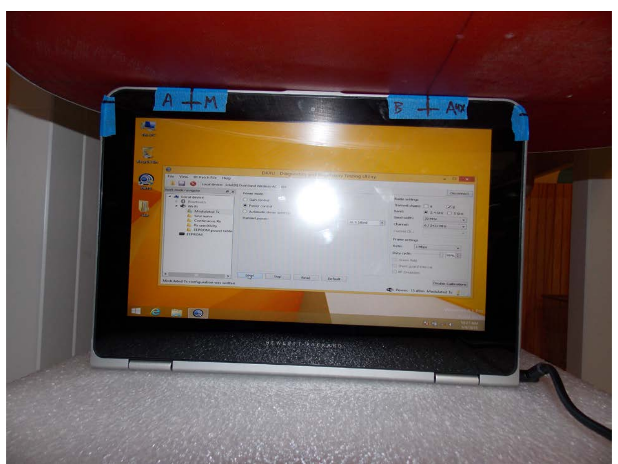
Test Position Front Edge 0 mm Gap