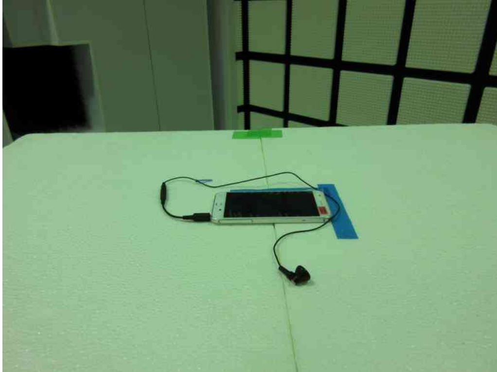
– X-axis –