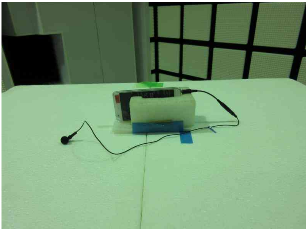
– Y-axis –