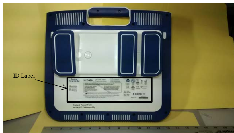
Figure 2 BSC Model 3300 – Back Label Location