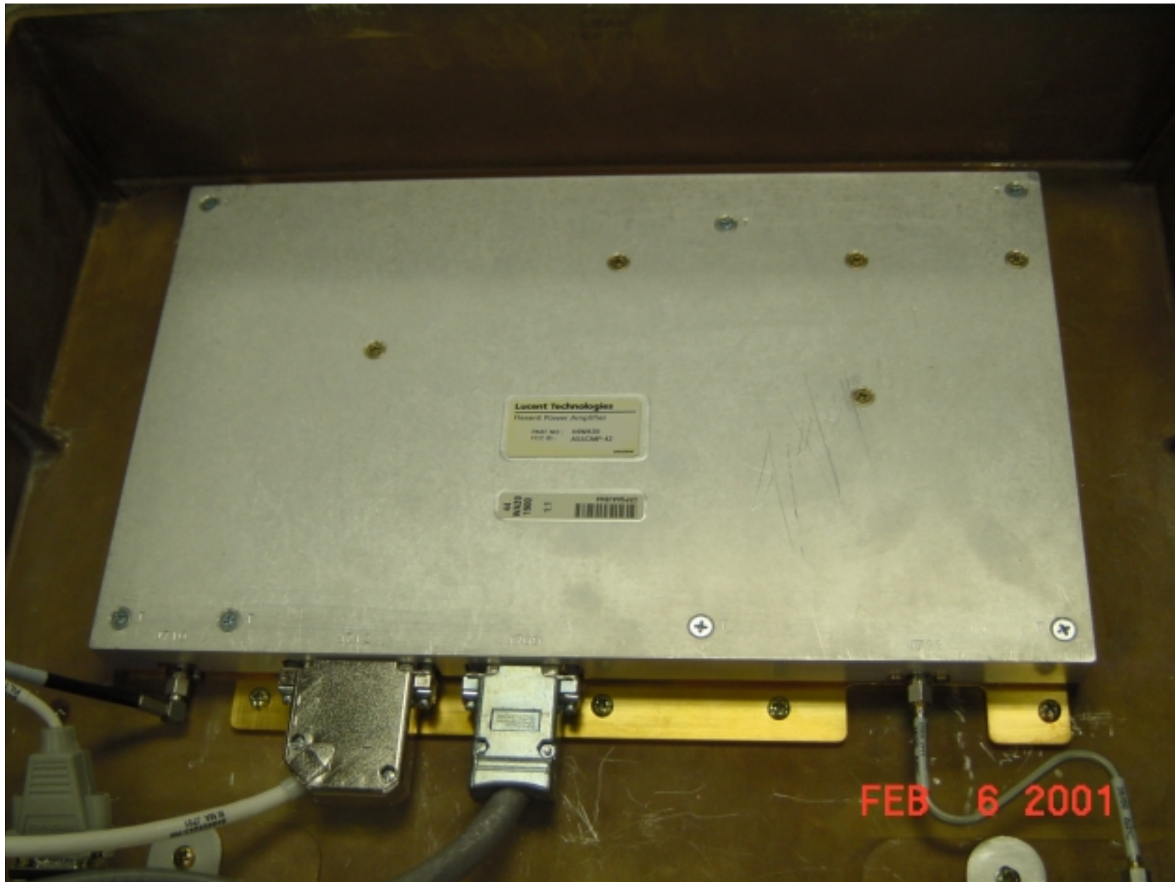
Photograph 1: PA Installed in a RFU cabinet