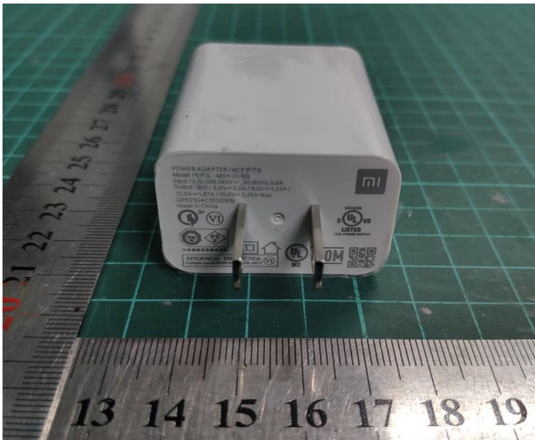
Adapter 2 b: Adapter