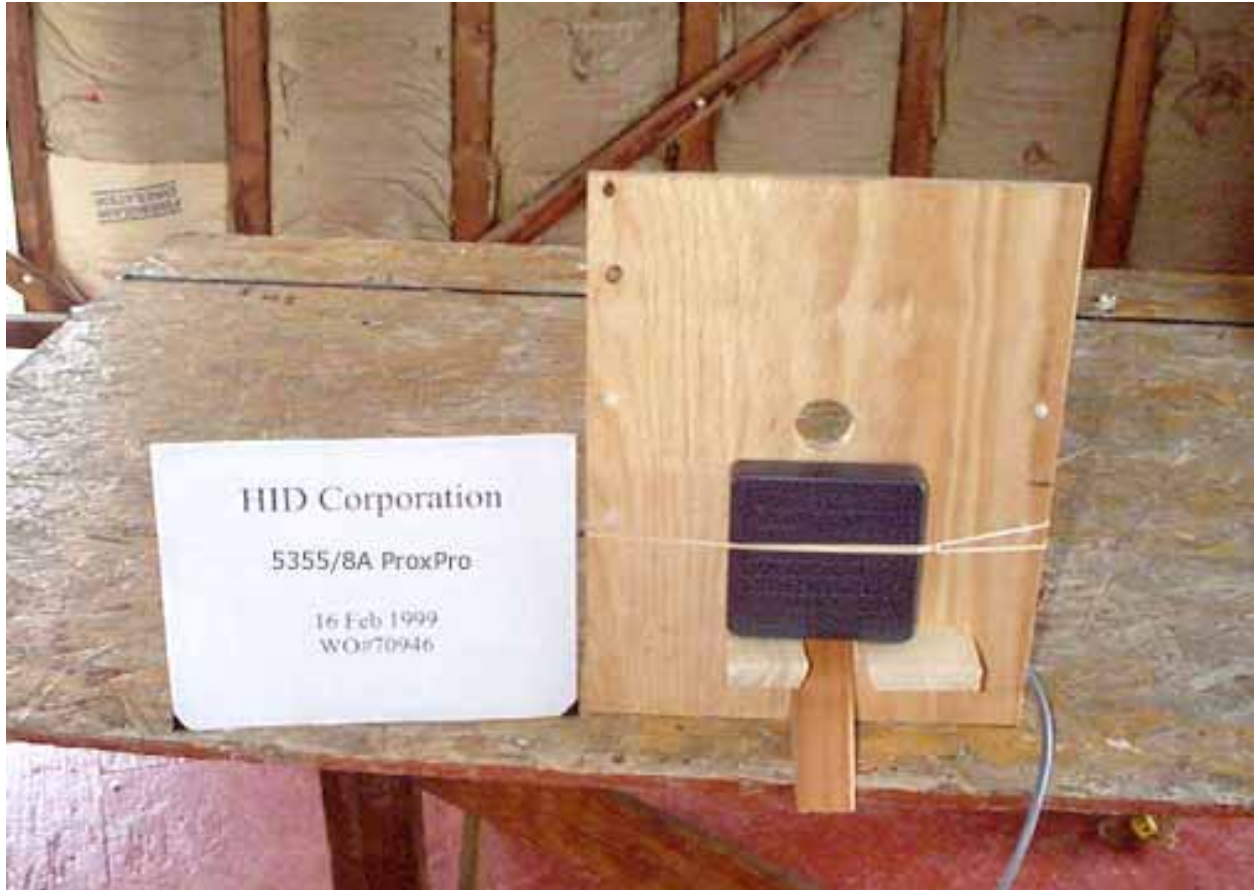
Radiated Emissions - Front View