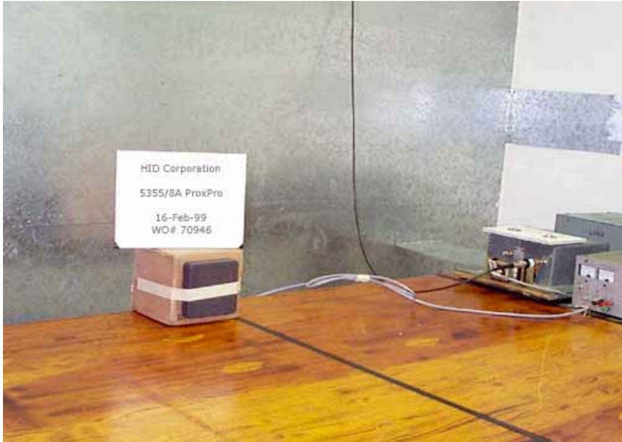
Conducted Emissions - Front View