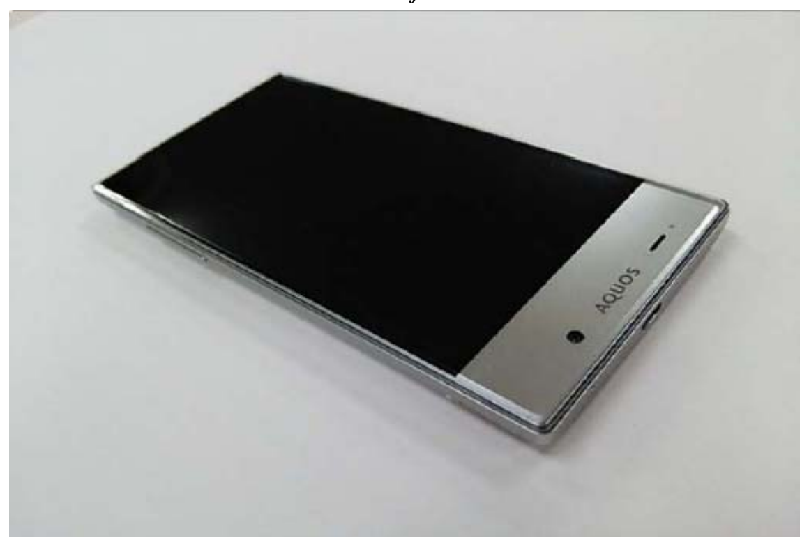
All View of EUT