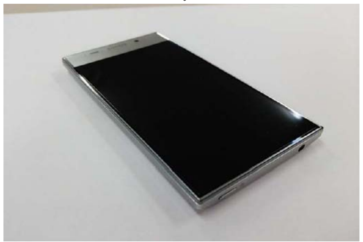
Side View of EUT - 3