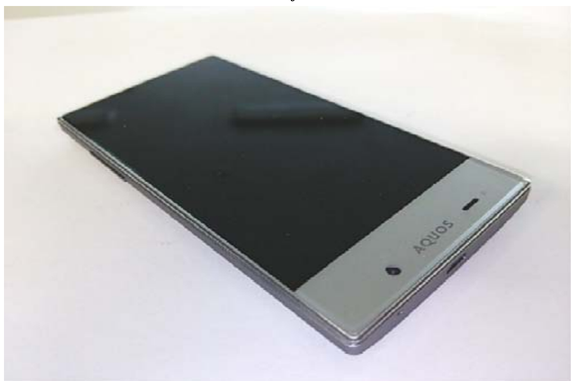
Side View of EUT – 2