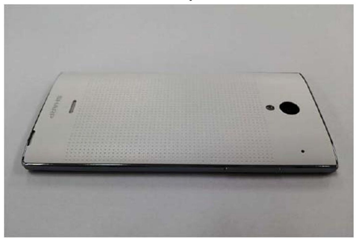
Side View of EUT - 1