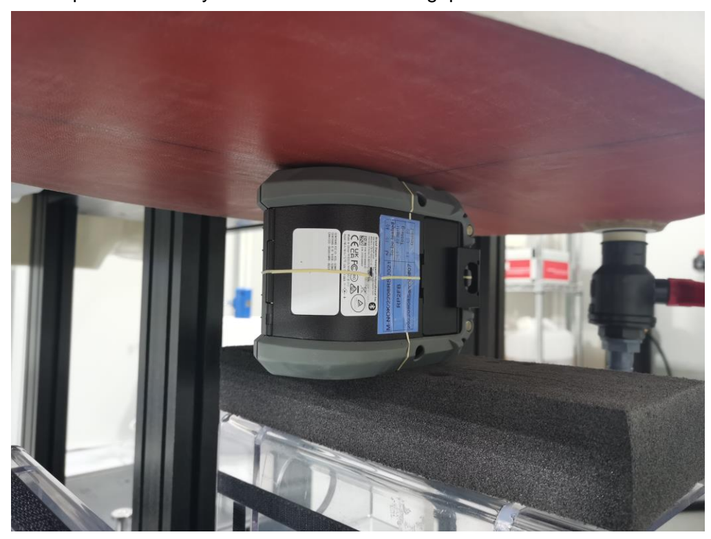
Description: Extremity Right Position with 0mm gap