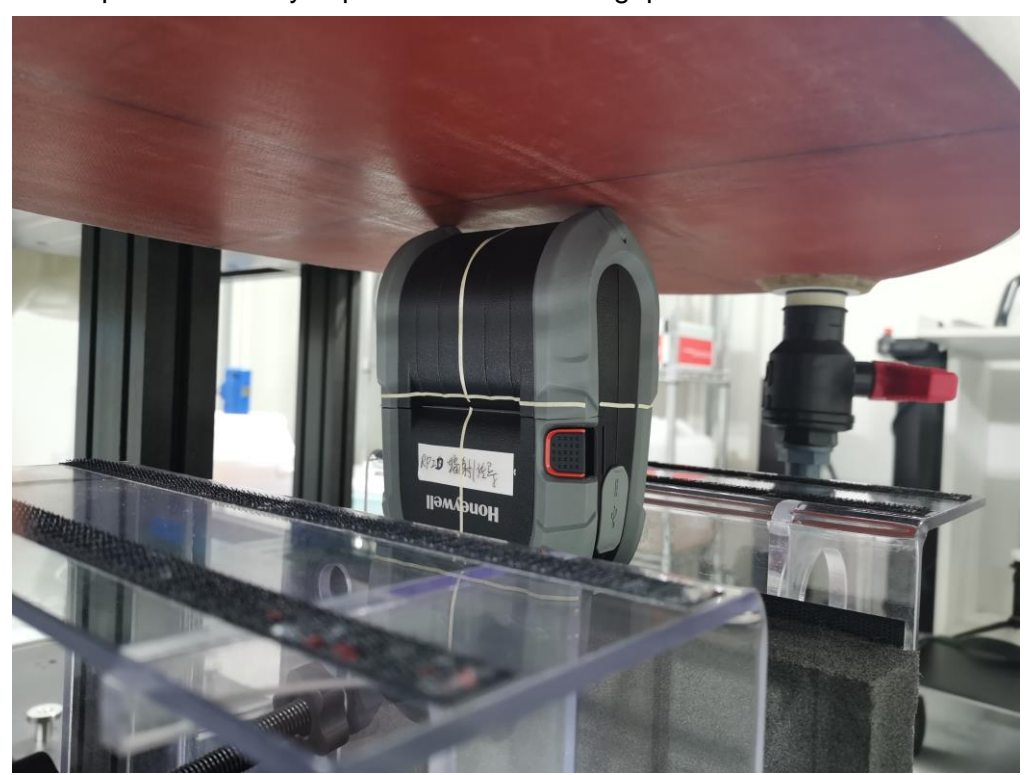
Description: Extremity Bottom Position with 0mm gap