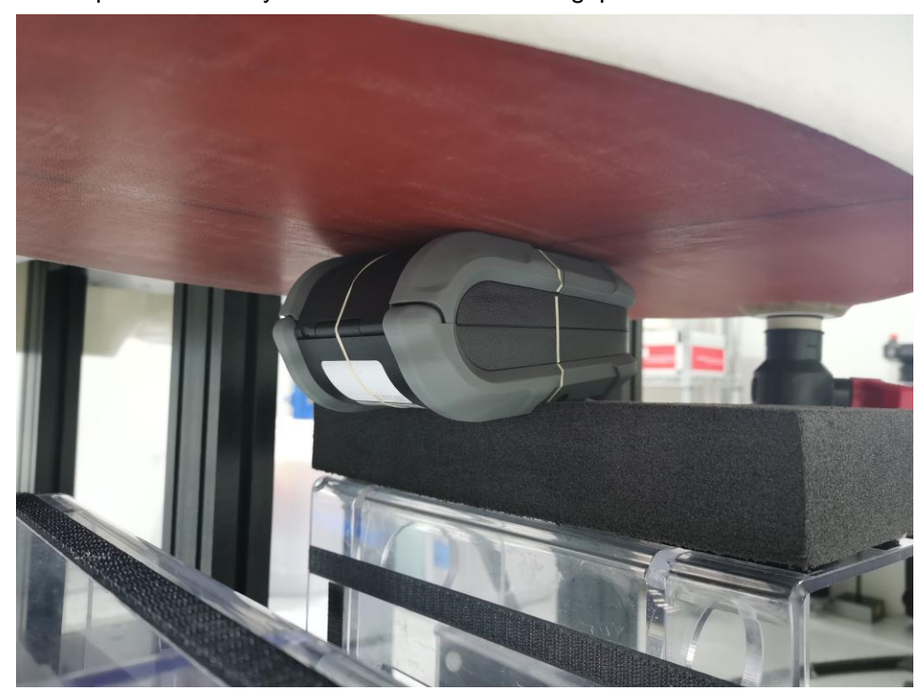
Description: Body Back Position with 0mm gap

Description: Extremity Front Position with 0mm gap