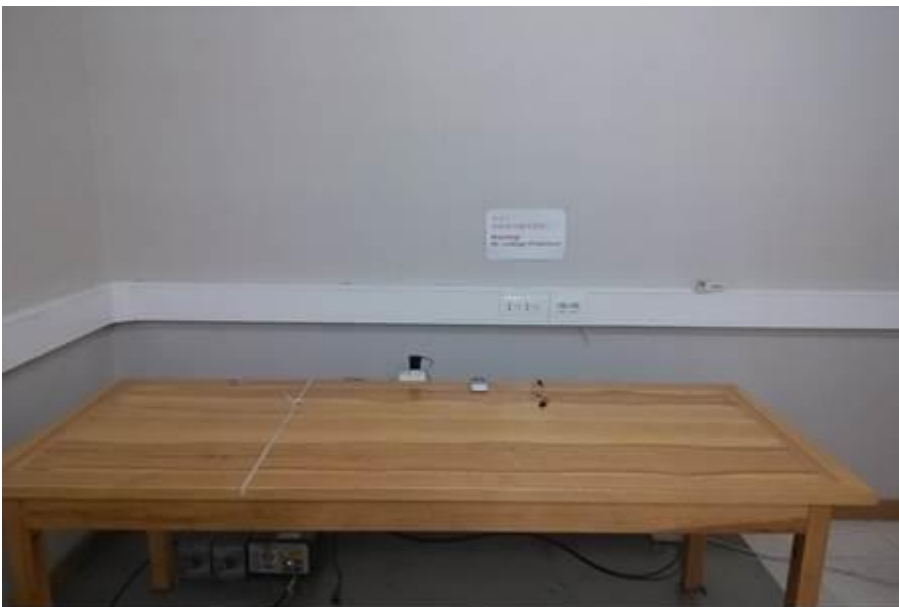
Picture 4. FCC Part 15C AC powerline conducted emissions