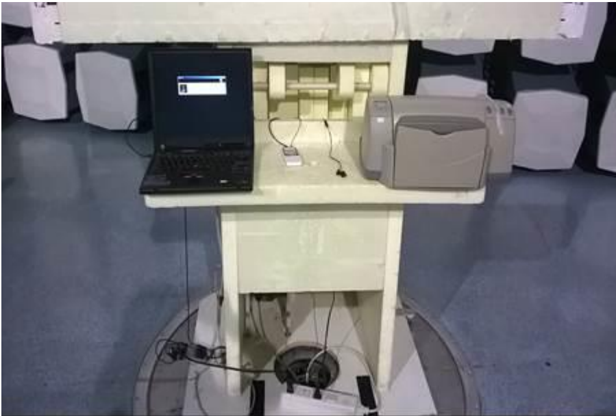
Picture 3. FCC Part 15B Radiated emissions, computer peripherals