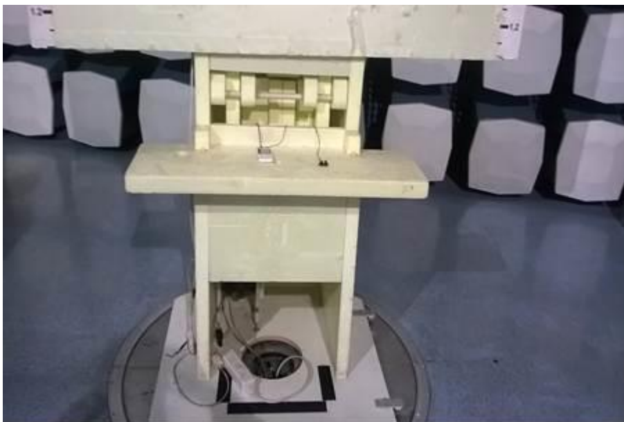
Picture 2. FCC Part 15B Radiated emissions