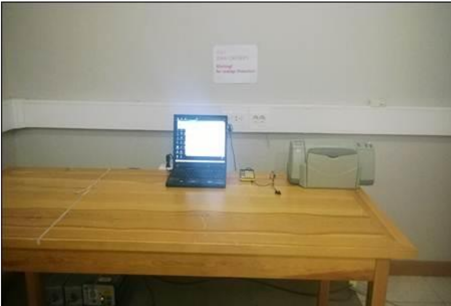
Picture 5. FCC Part 15B AC powerline conducted emissions, computer peripherals, measure from PC charger