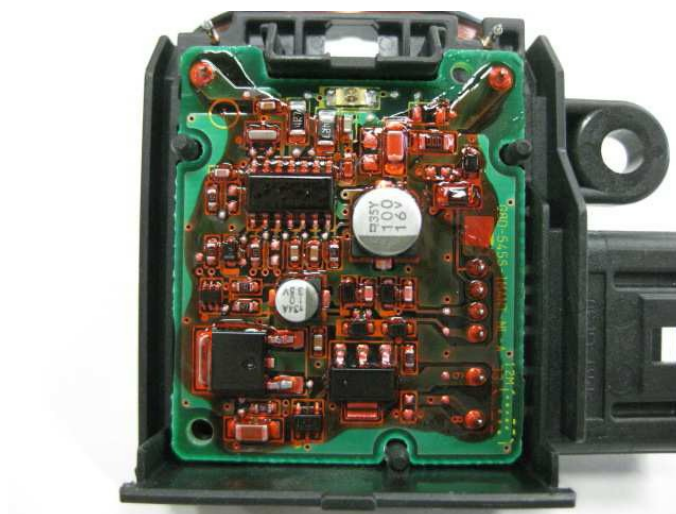
Figure 7.2.1 I54P0 PCB assy (front view)