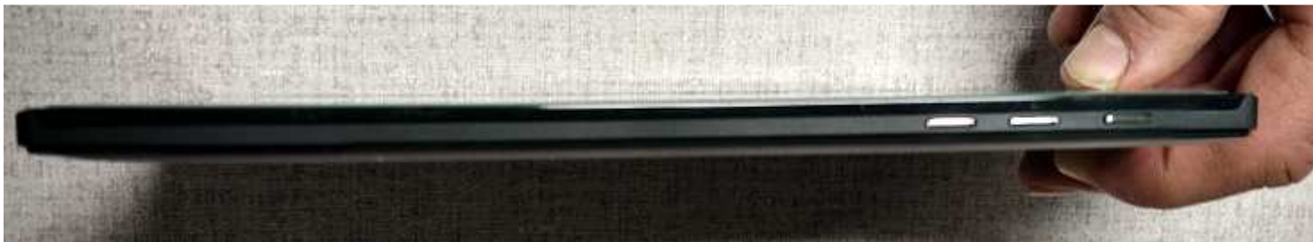
Top View – No Cover