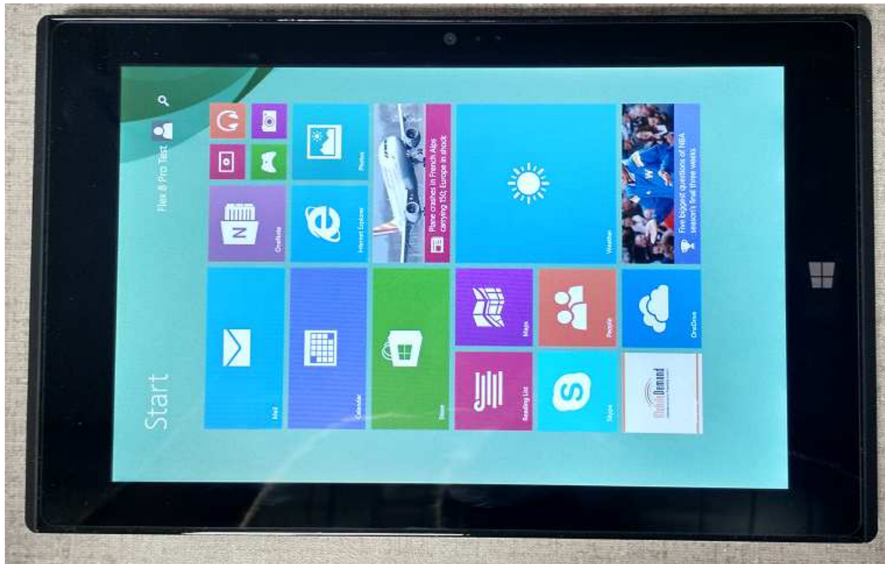
Top View - No Cover

Item 14: External Photos - EUT photos, internal and external, showing all faces of the device and all circuitry, and one shot per page. Photos shall show top and bottom of each circuit board, both with and without shields. Internal photos shall show the component placement on the chassis and the chassis assembly. If components are covered by an insulator, provide a photo with the cover on, and one with the cover removed. External photos shall show the overall appearance, the antenna used with the device (if any), and the controls available to the user. Please provide as ONE legible PDF document for internal photos and ONE for external photos.