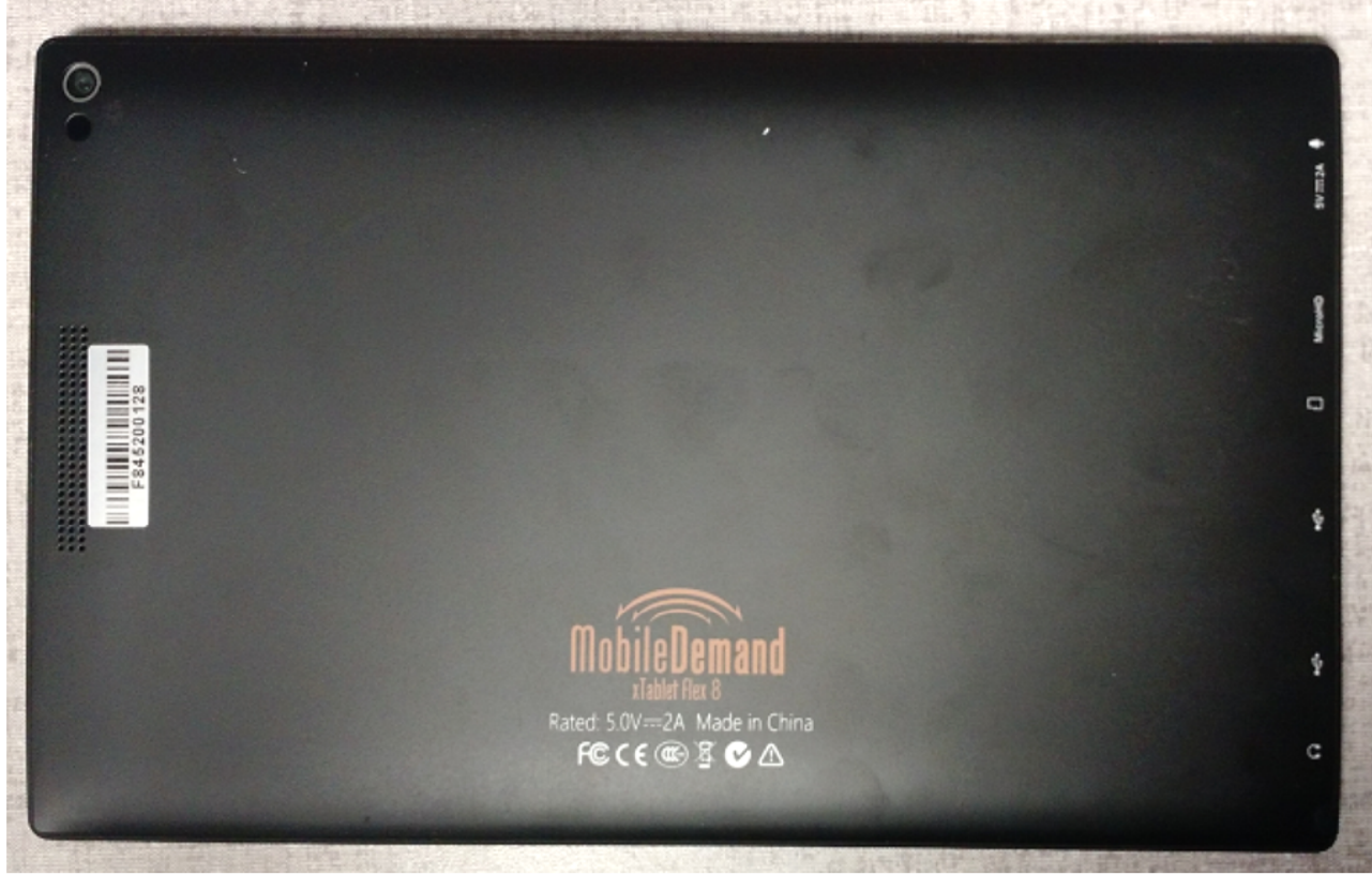
Rear View – No Cover