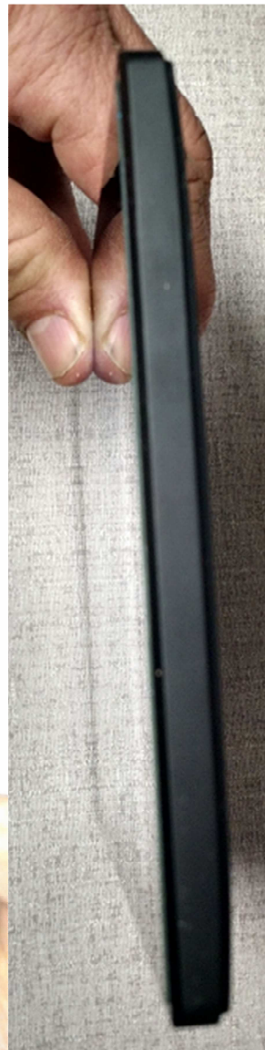
Right Side – No Cover