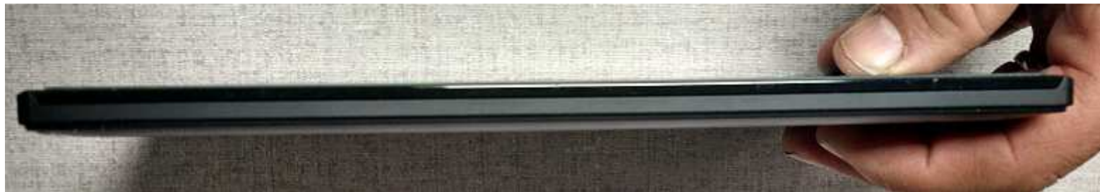
Bottom View – No Cover