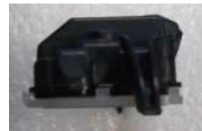
Left side view of Transmitter