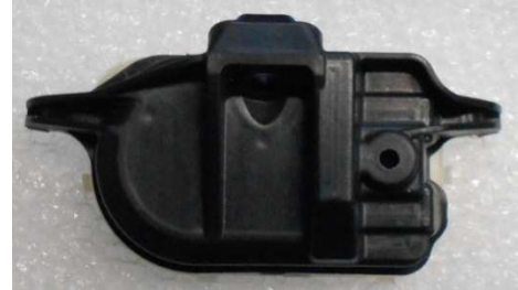
Bottom view of Transmitter