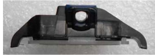
Rear view of Transmitter