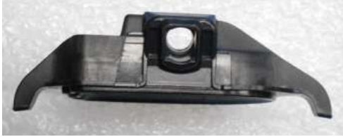
Front view of Transmitter