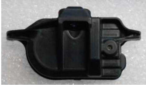
Top view of Transmitter