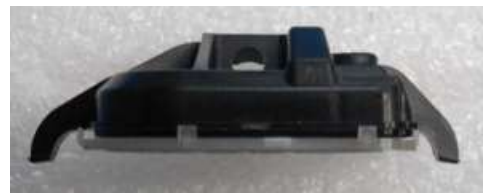
Right side view of Transmitter